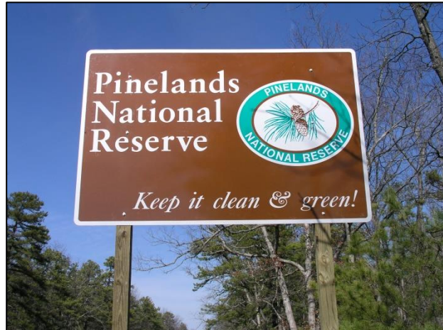
Above: In January of 2020, the Commission distributed two Pinelands National Reserve road signs that will be installed on the Atlantic City Expressway.