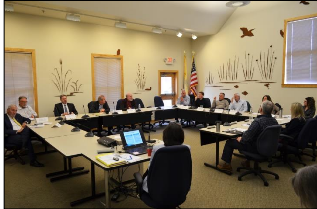
Above: On January 31, 2020, Commission staff convened a meeting to discuss draft water management policies with various stakeholders.

League of South Jersey, the Atlantic County Utilities Authority, New Jersey American Water Company, A.C. Schultes, Inc. (a private well-drilling company) and retired NJDEP staff. Staff will review the suggestions and questions raised at the meeting and then prepare CMP amendments for review by the P&I Committee.