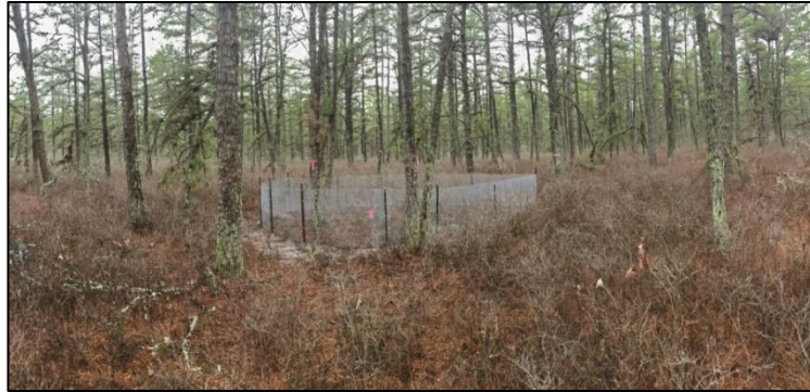
Above: A typical four foot high hardware cloth corral constructed around a snake den.