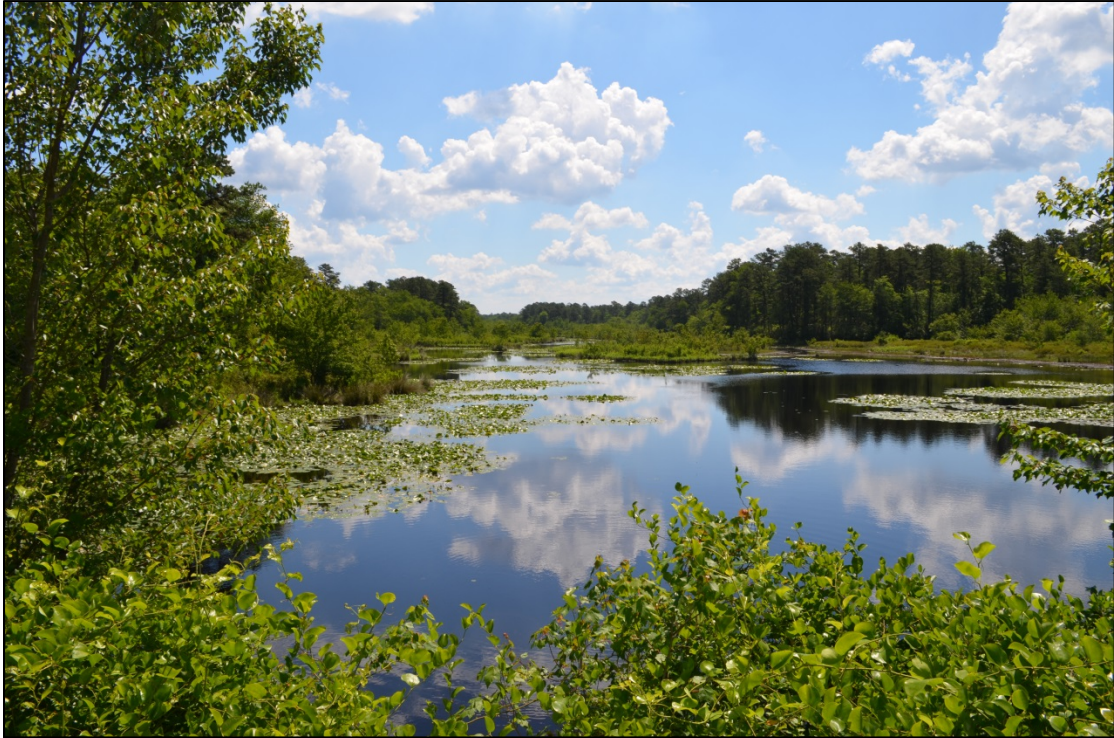
Above: The 457-acre Thompson-Wright property in Southampton and Woodland townships was protected in 2019 through the Pinelands Conservation Fund acquisition program.