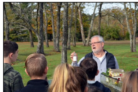
Above: Staff educated nearly 200 students about the Pinelands during the World Water Monitoring Challenge at Batsto.