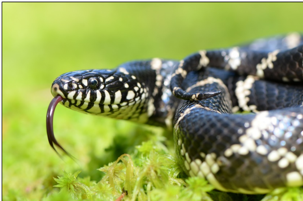
Above: An adult male eastern kingsnake currently being radio-tracked.