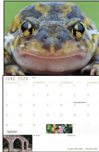
Above: The 2020 Pinelands wall calendar will be distributed by early December.