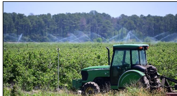
Above: The July 2022 severance of 11.25 Pinelands Development Credits resulted in the permanent protection of 224.48 acres of this blueberry farm in Hamilton Township, Atlantic County.