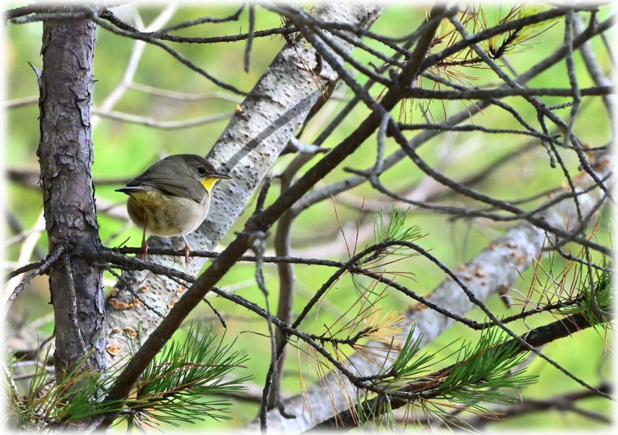
A common yellowthroat warbler at Cloverdale Farm County Park in the Pinelands in October