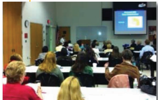
Middlesex County Fire Academy, May 16, 2011

Evaluations from the May 16, 2011 training at Middlesex County were positive. There are two additional trainings planned for June in Paramus and Sewell. It is expected that the training will be offered again in the fall. Check the New Jersey Learning Management Network (NJLMN) for date/location. This program will also be converted to an on-line training once the in-person trainings are completed. Look for the on-line module in late fall/early winter on NJLMN.