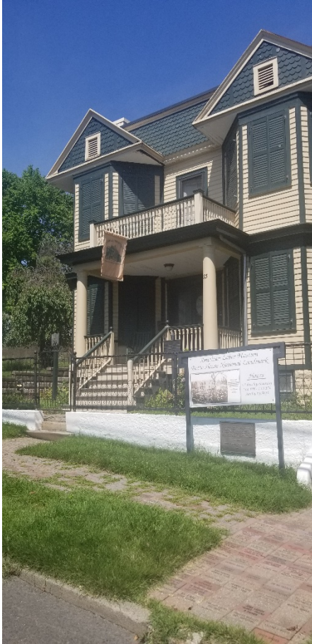
Figure 1: The American Labor Museum (Housed in the 1908 Botto House National Landmark)