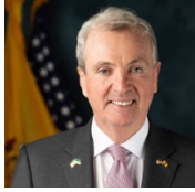
PHILIP D. MURPHY Governor, State of New Jersey