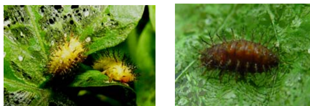
Figure 1. Mexican bean beetle larva and parasitized larva ("mummy")

Release decisions were based on monitoring the nurse plots two times per week; the sampling unit within each plot consisted of 125 plants with 25 plants examined in each of five locations where MBB feeding was observed. P. foveolatus releases were based on initial egg sighting ( egg release ) and larval counts ( trigger release ). Since 1985 egg releases have consisted of a total of 6,000 parasites with the first release of 3,000 P. foveolatus made at the first observation of a Mexican bean beetle (MBB) egg cluster. The second egg release of 3,000 parasites is made two to three days later; trigger releases began when larvae were first observed. The initial trigger release was divided into two releases, two to three days apart. If the MBB larval count increased seven days after the initial trigger release, then a second single trigger release was made.