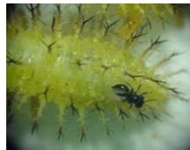
P. foveolatus on larva