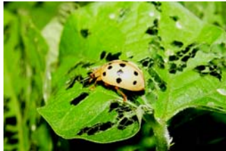
Mexican bean beetle adult