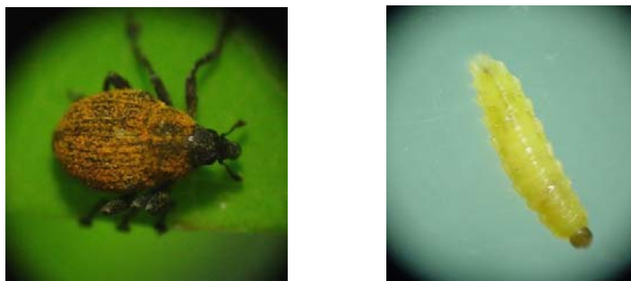
Figure 4. Rhinoncomimus latipes adult and larva

In 2004, the USDA approved the rearing and release of R. latipes , a stem-feeding weevil found in China and introduced into the United States in July 2004. R. latipes is approximately two millimeters long and usually black, though it may appear covered by an orange film, which it derives from feeding on mile-a-minute (Hough-Goldstein 2004a). R. latipes (Figure 4) feeds on the flower heads (capitula), leaves and ocreas with the females preferring the high protein capitula for egg production. Females deposit an average of 49 eggs over a 30-day period. The males prefer to feed mainly on the ocreas and leaves (Colpetzer et. al. 2004). The eggs are laid on the capitula and leaves; once the larvae hatch, they bore into the stem and feed for three weeks, before exiting and dropping to the ground to pupate (Flanders 2004). The portion of the stem above the feeding area is killed, thereby reducing seed production.