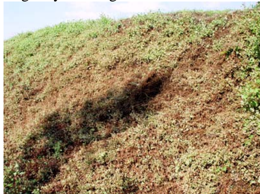
Figure 6. Defoliated Mile-a-minute.

Figure 6. shows a close-up of the weevil feeding damage at the Gloucester County site. Field personnel were able to easily collect 50-100 weevils, in less than a minute, by simply beating defoliated mile-a-minute vines gently with a gloved hand.