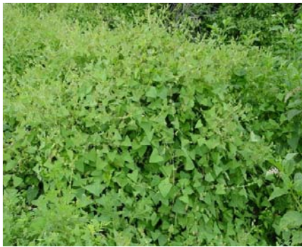
Figure 1. Growth habit of mile-a-minute