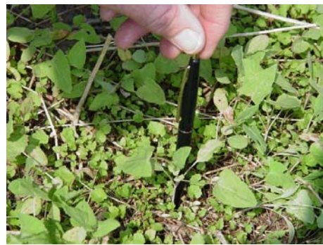
Figure 2. Mile-a-minute seedlings