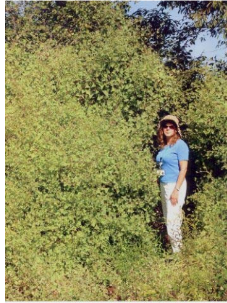
Figure 3. Mile-a-minute in April (left) and August (right).