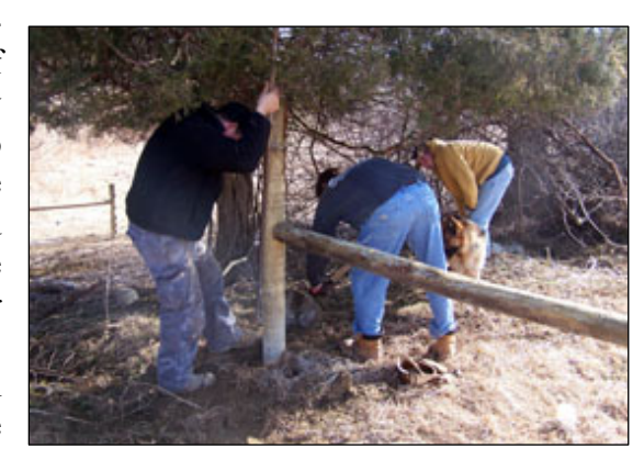
Fencing being installed at Howling Wolf Farm in Hope.

- The New Jersey Department of Agriculture partnered with the New Jersey Audubon Society (NJAS) to farmers encourage to undertake conservation projects to protect soil and water resources and increase productivity and profitability on their farms. The Department awarded NJAS with a $50,000 grant for its mini-loan program that provides farmers in the state with funding to assist them in