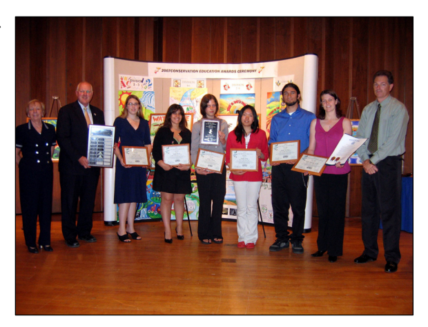
The High Tech High School Team receiving its honors.

2007 Envirothon -- The 2007 winners of the New Jersey Envirothon, High Tech High School in Hudson County, placed 5<sup>th</sup> in the National 2007 Canon Envirothon, held this summer at Hobart and William Smith Colleges. Two hundred and sixty students from 45 U.S. teams and eight Canadian teams participated in North America's largest environmental education competition.