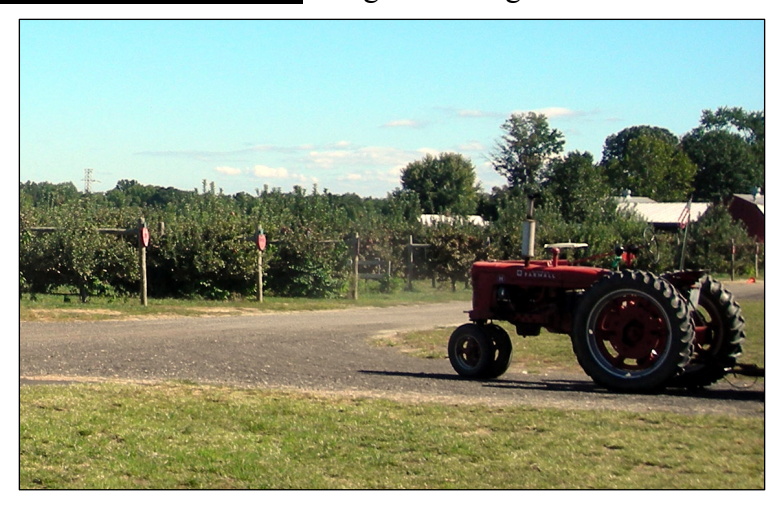
Hayride to pick apples at Johnson's Corner Farm in Medford.