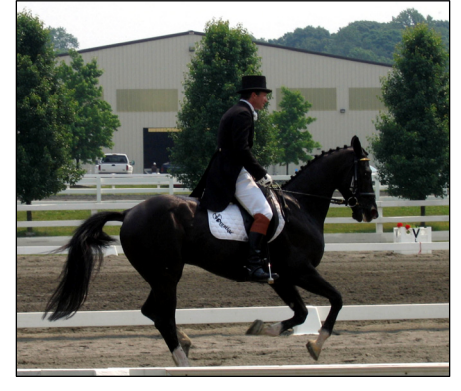
Rider competes in dressage at the Three-Day at the Horse Park of New Jersey.

Jersey Fresh Three-Day -- The 5th Annual Jersey Fresh CCI**/CCI*** was held May 30 - June 3 at the Horse Park of New Jersey, hosting more than 140 horses from eight countries. The estimated economic impact for the event was more than $8 million dollars.