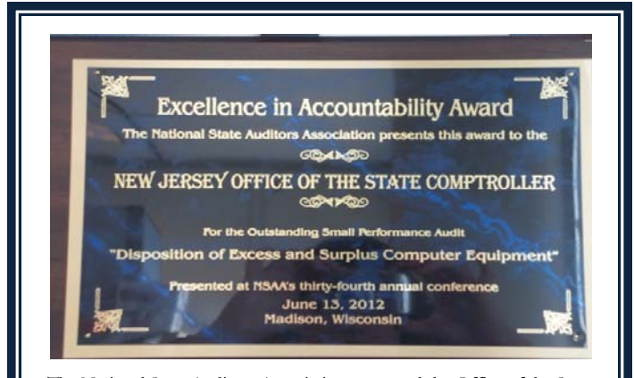
The National State Auditors Association presented the Office of the State Comptroller with its Excellence in Accountability Award in June 2012 for an audit that found confidential data on nearly a third of the state computers set to be auctioned from the state's surplus property warehouse.

During FY 2012 we issued a follow-up report concerning an earlier audit of the state's Division of Developmental Disabilities (DDD). The follow-up review documented millions of dollars in recoveries the had obtained stemming state from recommendations contained in the initial OSC audit. For example, the original audit had found that a DDD service provider had been reimbursed for a series of inappropriate expenditures, including reimbursements for cruises to the Mediterranean and Caribbean taken by the provider's management, staff and DDD clients. DDD ultimately determined that the service provider was responsible for returning $353,000 of those expenses. The state recovered the money by withholding funds from future contract payments.