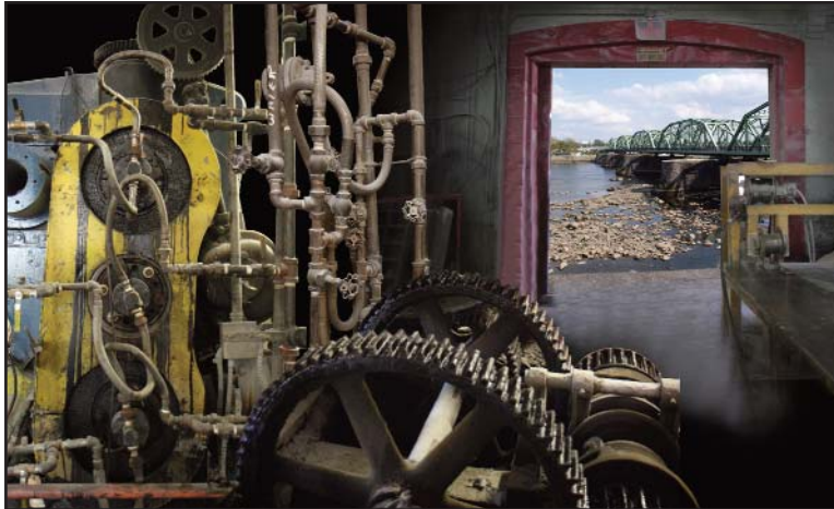
Middle section of the mural to be painted on the Home Rubber Company building along Route 129 in Trenton.

The course examined the history of mural art as well as issues of design and