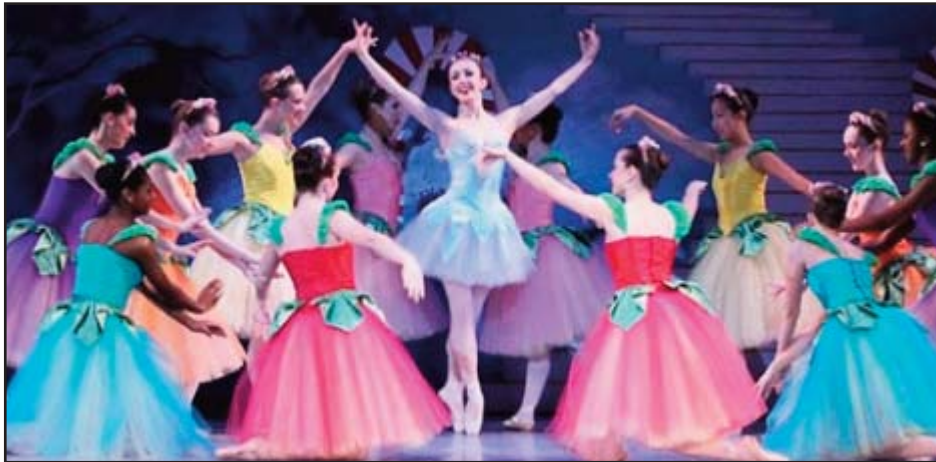
ARB Nutcracker will be danced on the Patriots Theatre stage in the War Memorial on December 10.