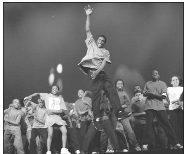
TEDI dancers run, jump and share the joy of life and dance.

presented at the May concert will include: Jump , which celebrates the sheer joy of life and dance; Early Eugene , part of TEDI's Celebration of Literature Program, a piece based on the early work and memoirs of playwright Eugene O'Neil; Wade in the Water , a moving traditional spiritual; Free Rides of the Planets , based on a poem by E.L Doctorow (Ragtime), which allows the dancers to literally defy the confinement of gravity and soar.