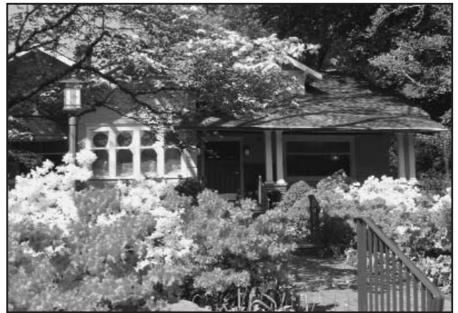
Azaleas surround Sayen House and overflow into the gardens.