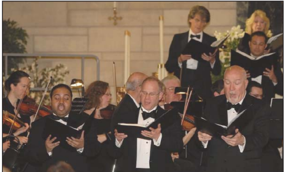
Voices Chorale will perform An American Holiday concert on December 18 and 19.