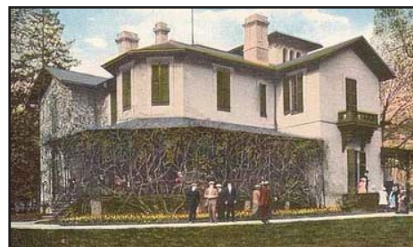
Old postcard view of Ellarslie Mansion

Ellarslie's pcoming series of exhibits and special events include: