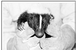
Eastern Striped Skunk

While the primary purpose of the Center is to provide a community resource to handle wildlife questions and problems, of equal importance are the educational