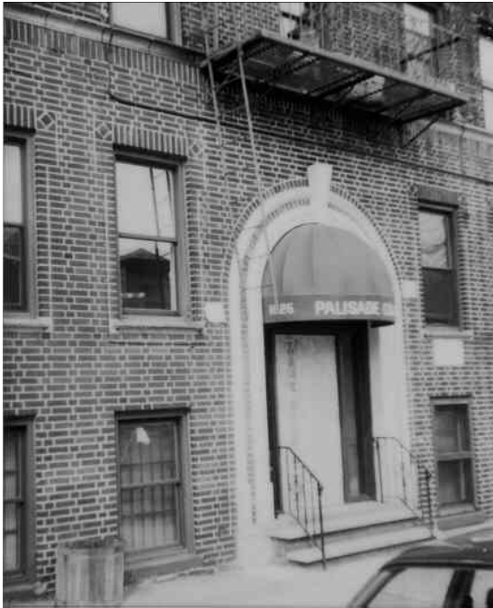
Figure 3 - View showing fire escape ladder on Division "A" where FF Velez fell

began to climb down the ladder, which was a vertical drop-down type suspended by a cable over a pulley and counterbalanced with a weight on the end of a cable. This type of ladder is not secured tightly to the fire escape frame, rather it moves vertically through a set of guides at the fire escape landing and is not secured at all at the bottom of the ladder. At about the point when Velez was two rungs down from the top of the ladder, his weight caused the heel of the ladder to suddenly shift horizontally across the doorway of the front entrance below. Velez lost his grip on the ladder and began to fall backward. Still holding the child inside his coat, he hit his head on an adjacent second floor windowsill and fell to the sidewalk fifteen feet below. It was at this point that FF Viscardo was crossing the street to help Velez with the rescue effort and he witnessed Velez falling from the ladder. As Velez landed on his back, on top of his SCBA cylinder, the child was dislodged from his coat due to the impact of the fall and landed on the sidewalk approximately