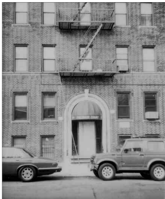
Figure 2 - View of 1625 Palisade Ave. shown from Division "A"

there were multiple fires burning inside the structure and that it appeared they were intentionally set. He also requested that NBFD units assist with rescue and evacuation efforts at the scene.