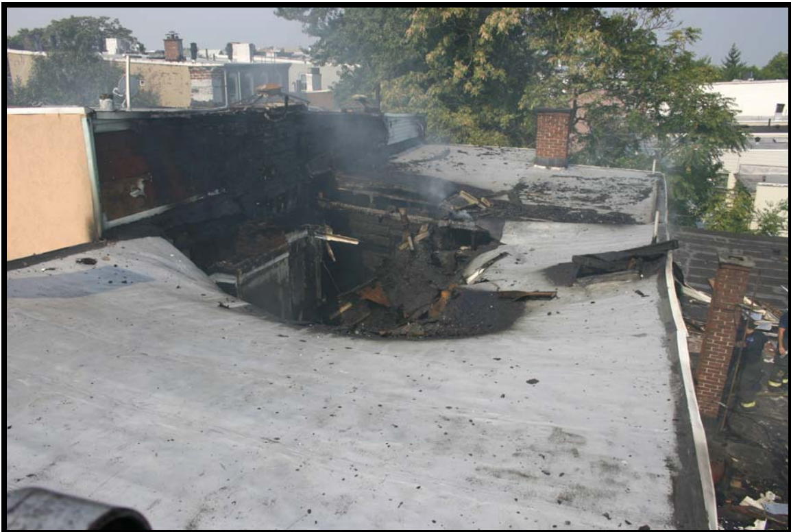
Figure 2 - Rooftop view of 1813 Bergenline Avenue and adjoining exposure building - The vertical shaft is located at the center of the burned out area against the abutting structure

What was learned later through investigation but not immediately known at the time was that this fire was burning uncontrolled inside a large, open ventilation shaft on the interior of the structure. Inside the apartments, there were windows into the shaft for ventilation and light; it was through these windows that the fire was extending into all levels of the structure. It is believed that a failure of these shaft windows resulted in the sudden eruption of fire into the apartment, trapping FF Neglia.