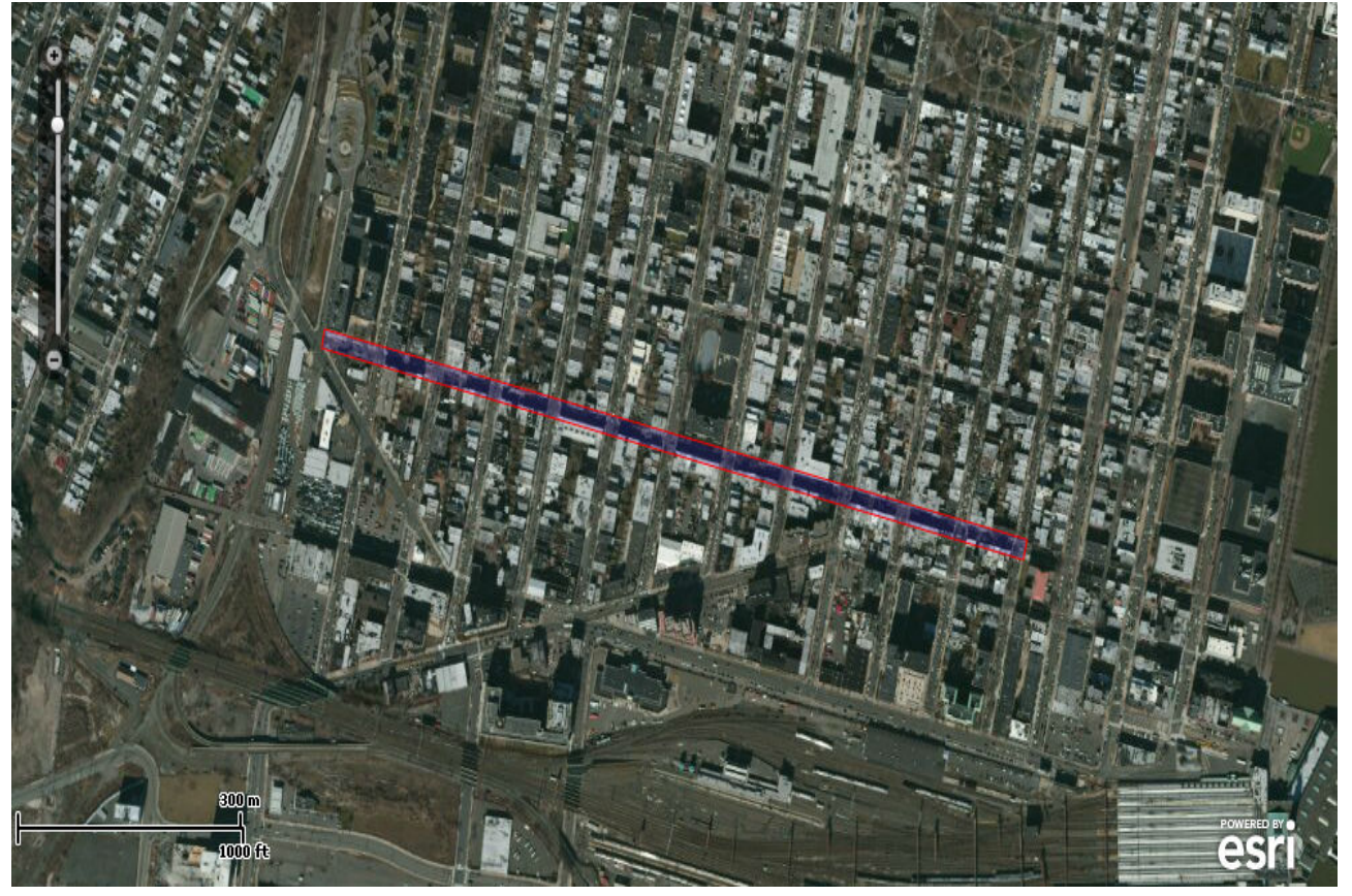
Project Location Map: