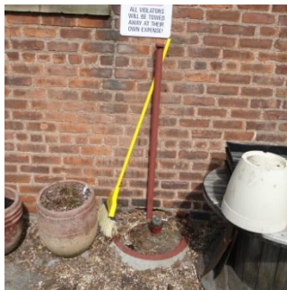
This fill port is located at North end and tank (275 gallon)

The following photographs are of the four fill lines that have AST attached in the basement. There are also pictures of two capped areas where the fill pipe and vent once existed that have since been removed.