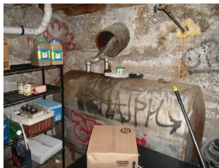
is an active fill port and