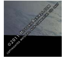
Unknown County, ?? (2006)