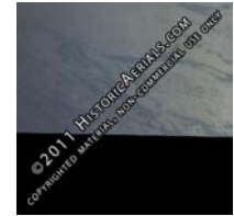
Unknown County, ?? (2006)