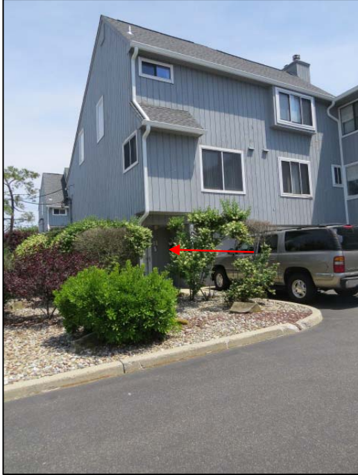
Photograph 1: Front of subject property.