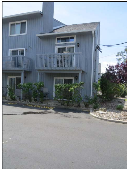
Photograph 2: Rear of subject property.