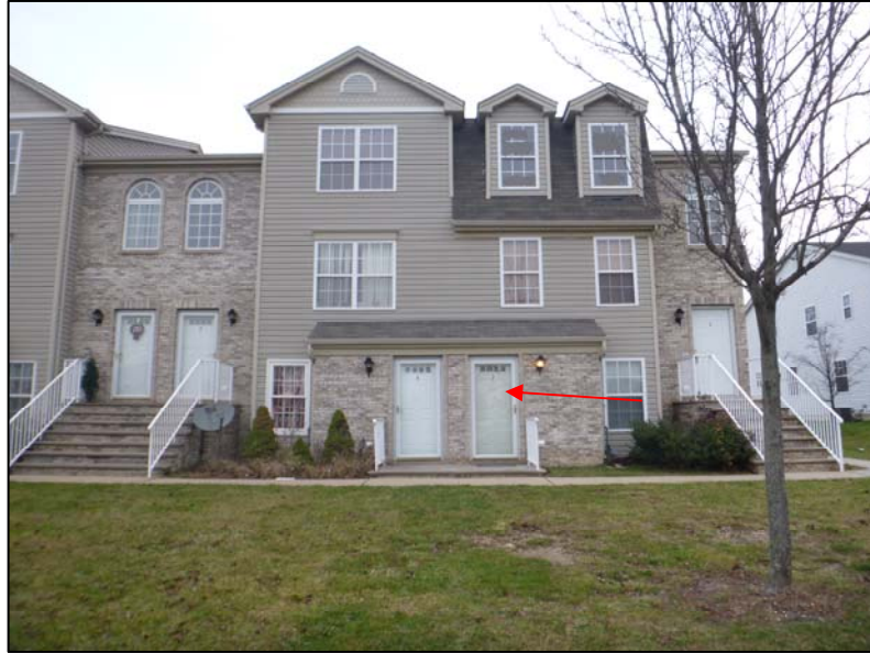
Photograph 1: Front of subject property.