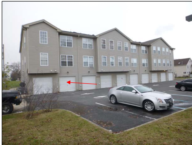
Photograph 2: Rear of subject property.