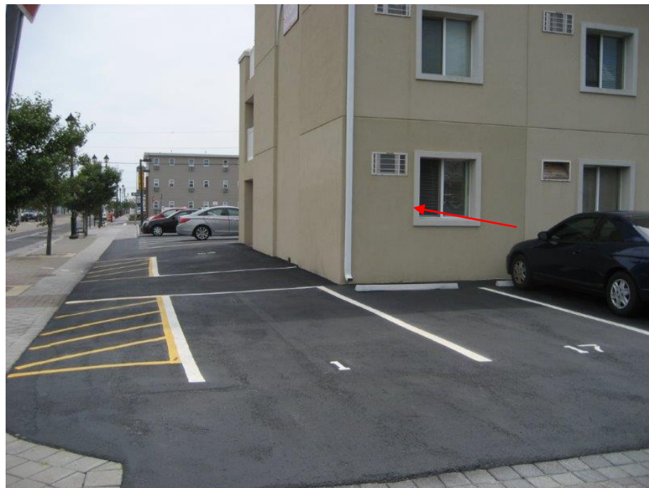
Photograph 2: Rear/side of subject property.