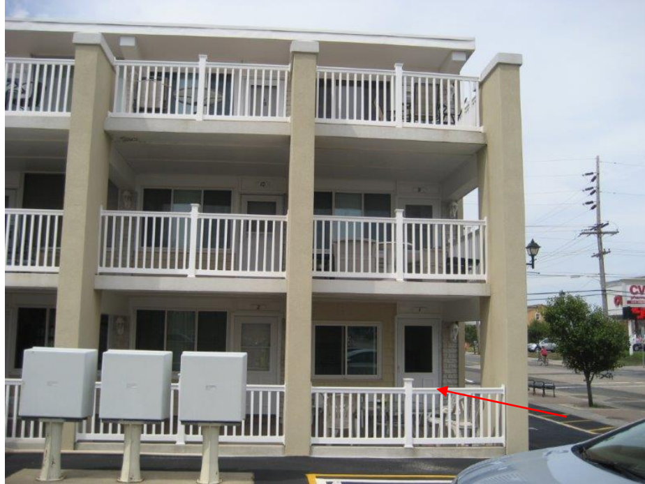
Photograph 1: Front of subject property.