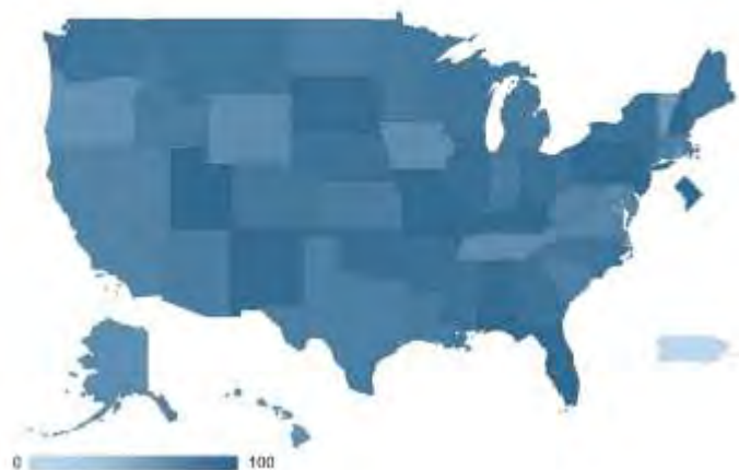
Children Receiving Visits in the Home (%)