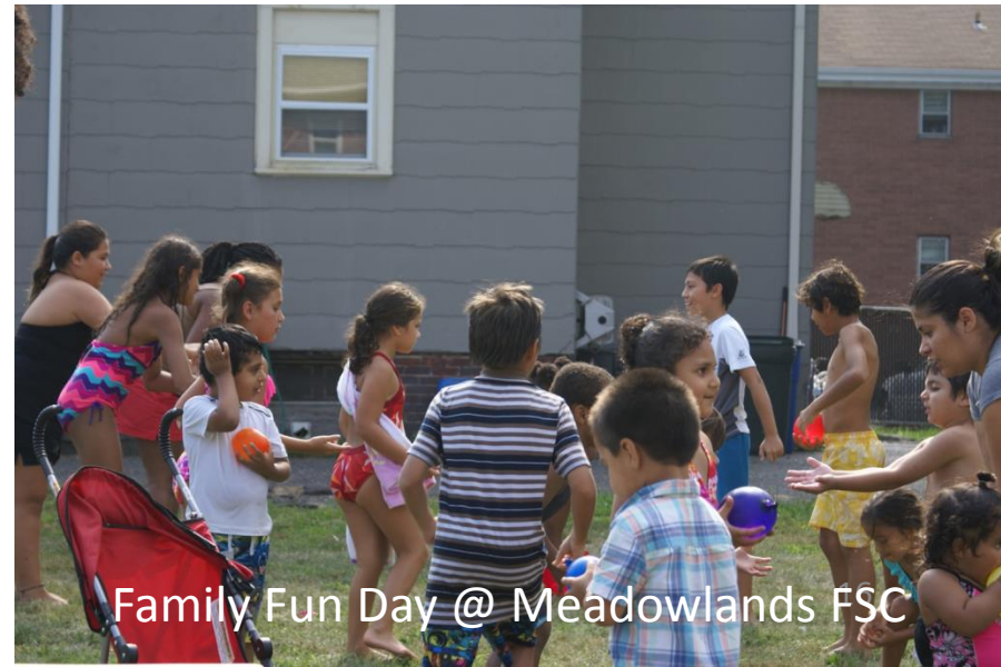
Family Fun Day @ Meadowlands FSC