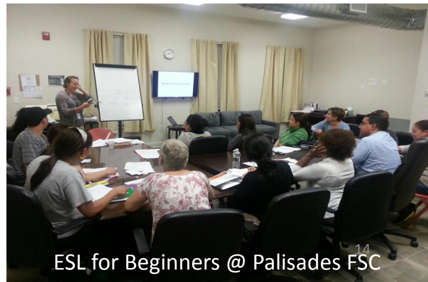
ESL for Beginners @ Palisades FSC