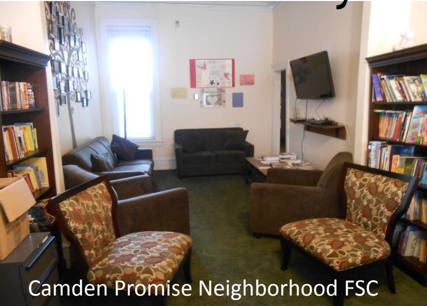
Camden Promise Neighborhood FSC