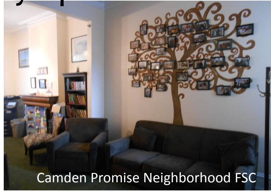
Camden Promise Neighborhood FSC