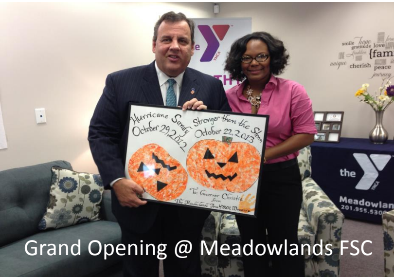
Grand Opening @ Meadowlands FSC