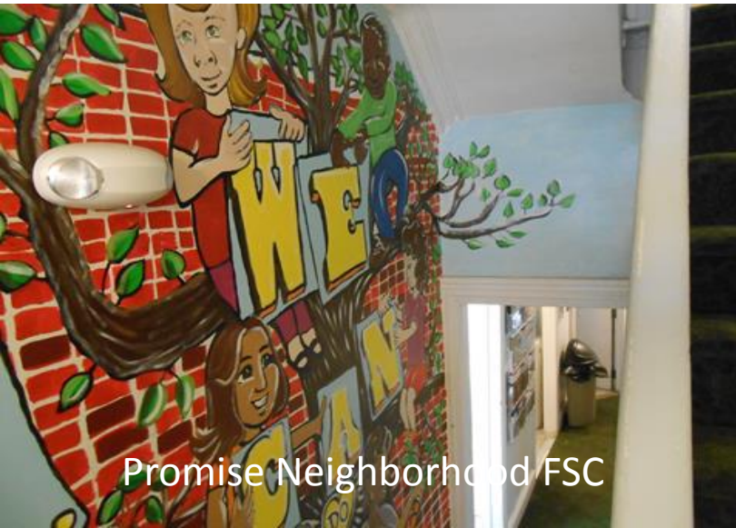
Promise Neighborhood FSC