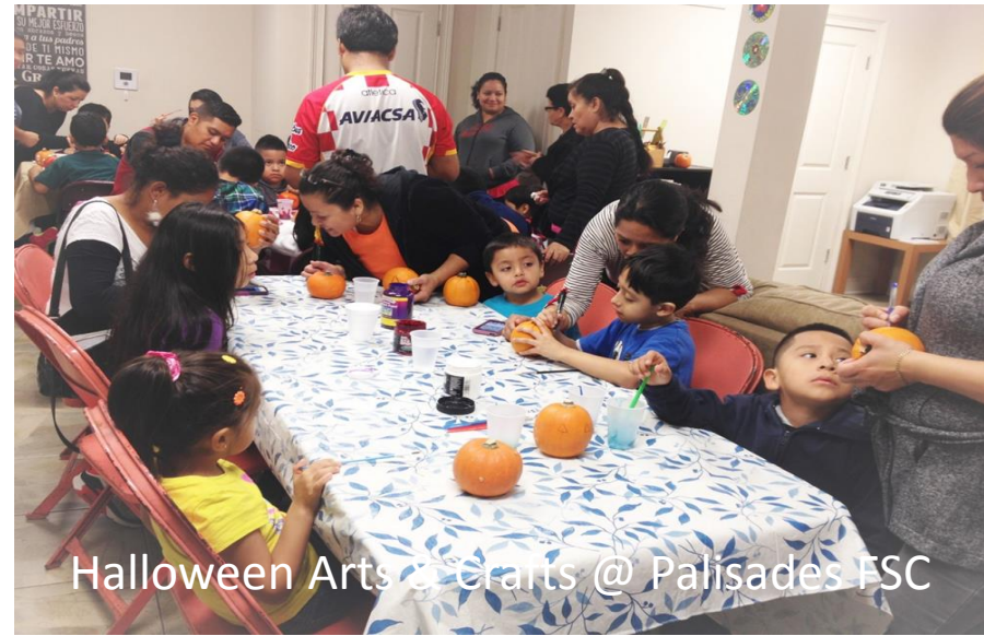
Halloween Arts & Crafts @ Palisades FSC