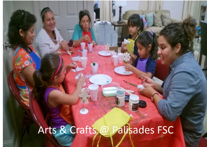
Arts & Crafts @ Palisades FSC