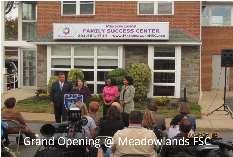
Grand Opening @ Meadowlands FSC