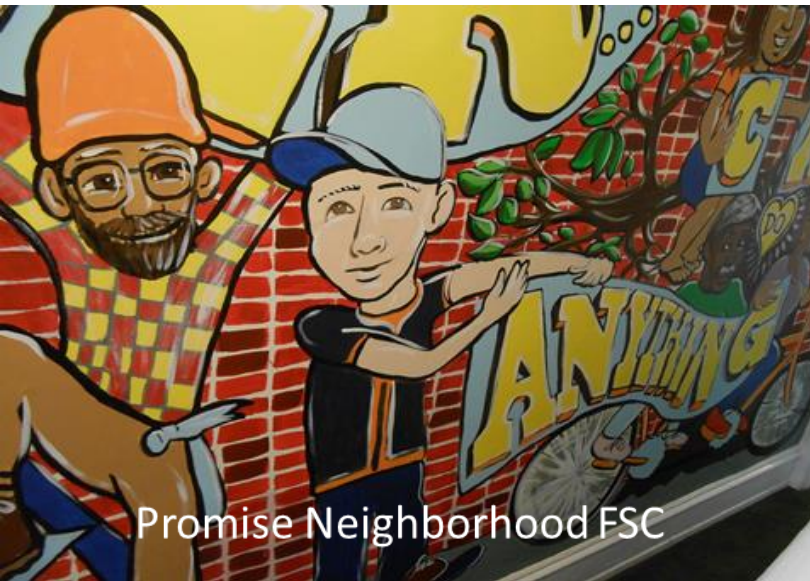
Promise Neighborhood FSC