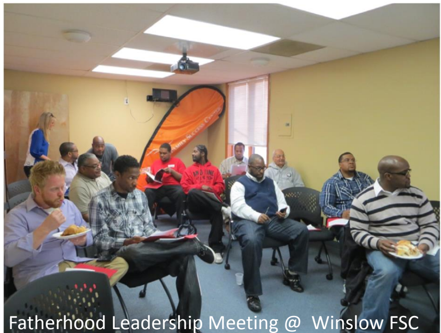
Fatherhood Leadership Meeting @ Winslow FSC