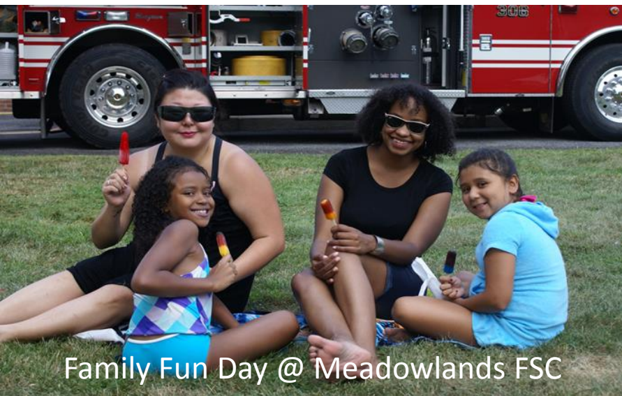
Family Fun Day @ Meadowlands FSC