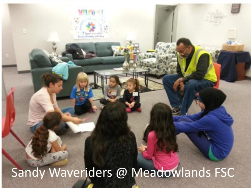
Sandy Waveriders @ Meadowlands FSC