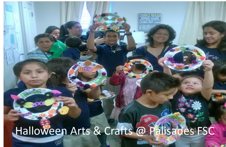
Halloween Arts & Crafts @ Palisades FSC