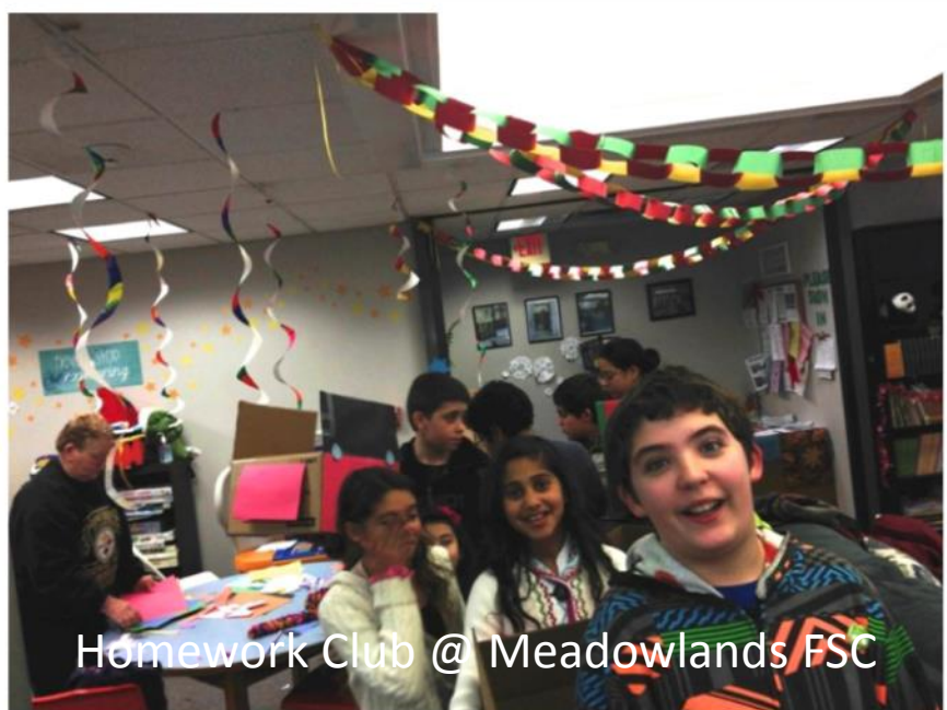
Homework Club @ Meadowlands FSC