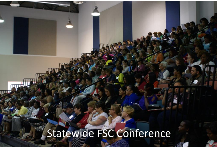
Statewide FSC Conference