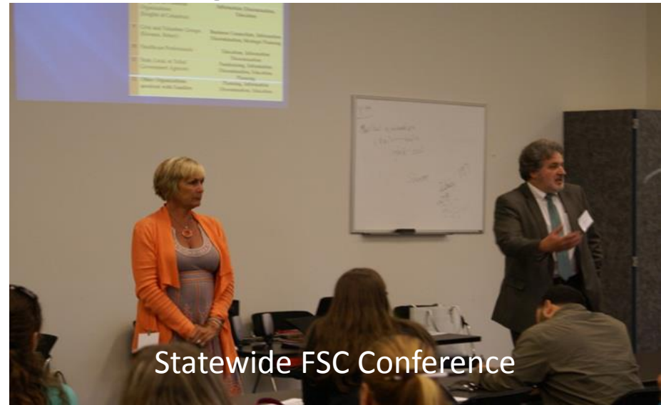
Statewide FSC Conference