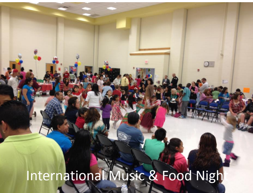
International Music & Food Night