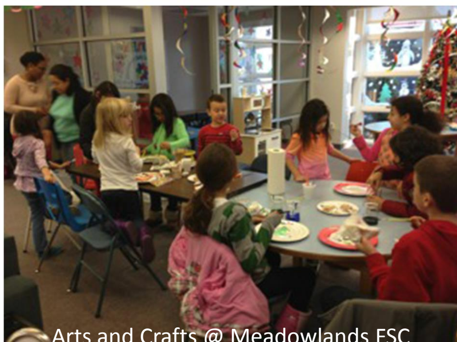
Arts and Crafts @ Meadowlands FSC