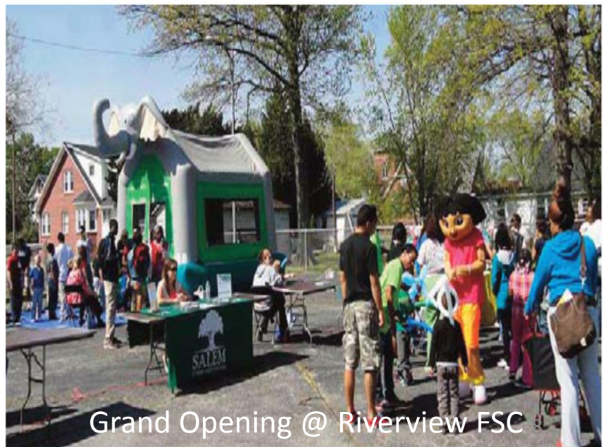
Grand Opening @ Riverview FSC