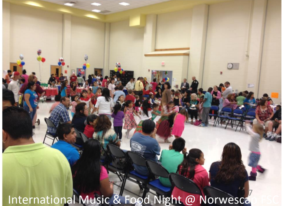
International Music & Food Night @ Norwescap FSC