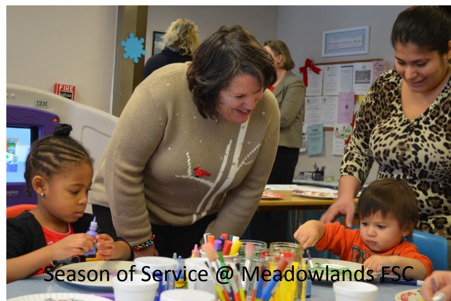
Season of Service @ Meadowlands FSC