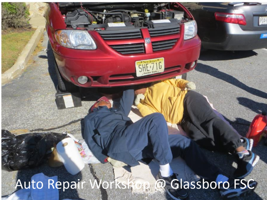
Auto Repair Workshop @ Glassboro FSC