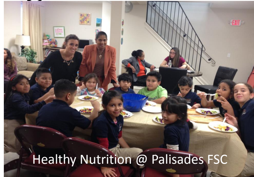
Healthy Nutrition @ Palisades FSC