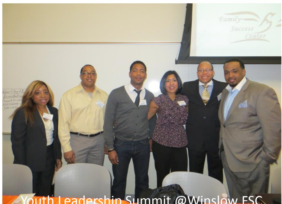
Youth Leadership Summit @ Winslow FSC