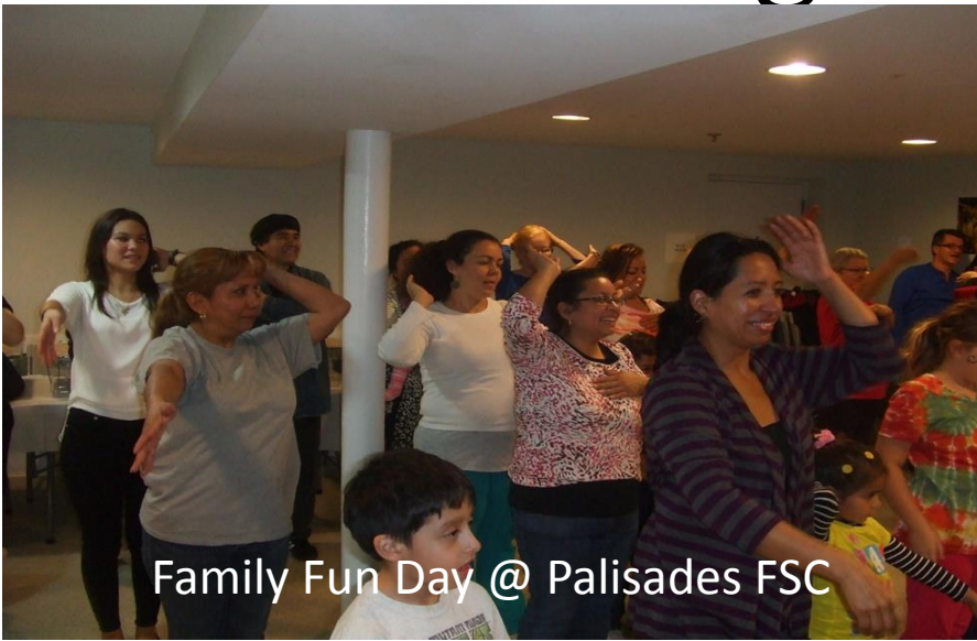
Family Fun Day @ Palisades FSC