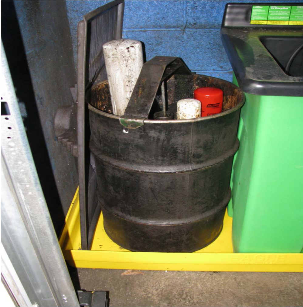
Spill Containment for Drums