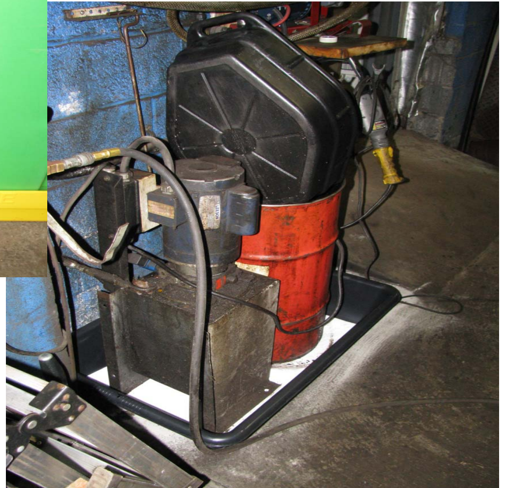
Spill Containment for Liquid Transfer Areas