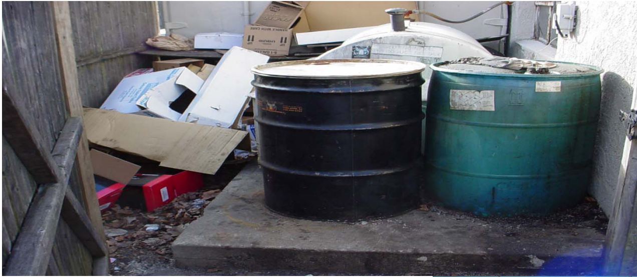
Waste Storage Area