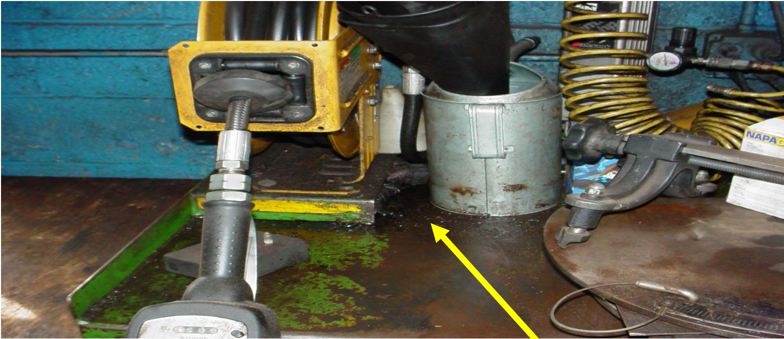
Bulk oil delivery system shows evidence of leaks or spills.