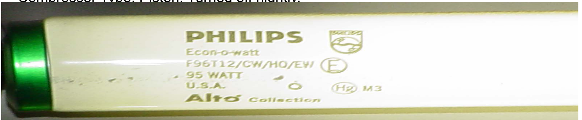
The facility mainly has T12 lighting, but has begun switching to T5 lights.