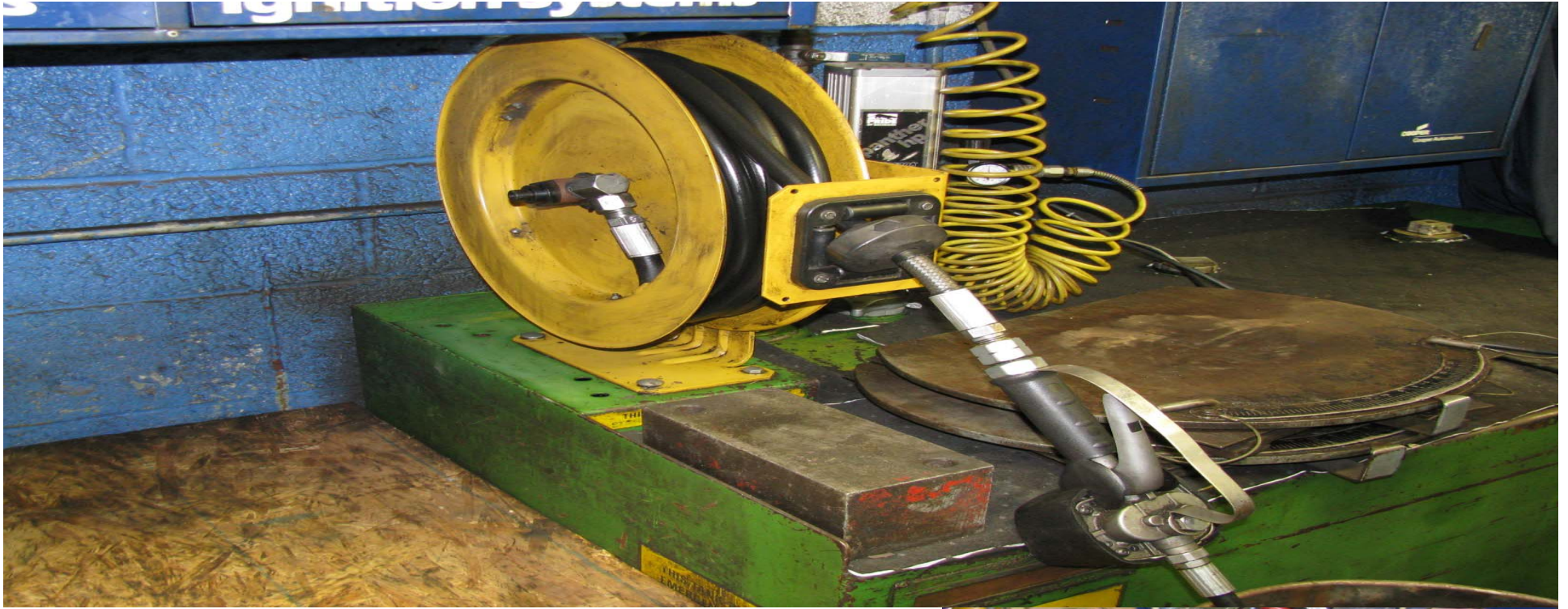
Repaired leak in oil transfer area.