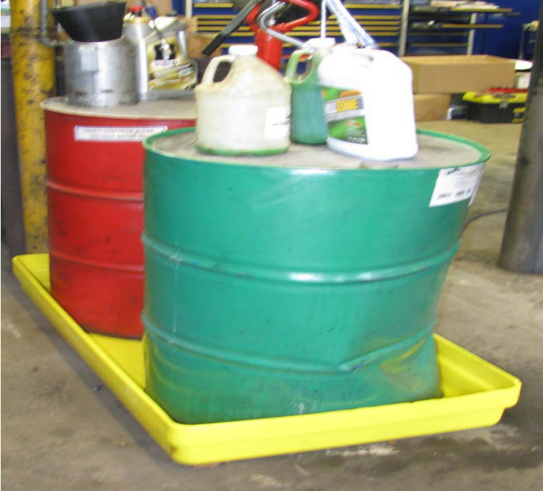
Placed drums in secondary containment