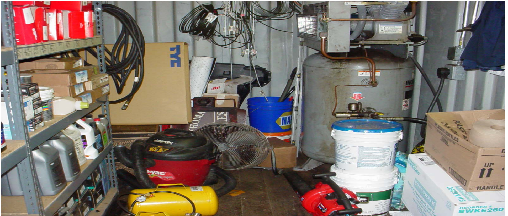
Storage Room and Compressor Compressor Type: Piston. Turned off nightly.