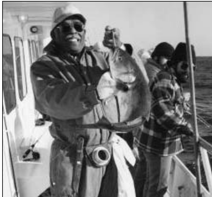
Bluefish are fighters.