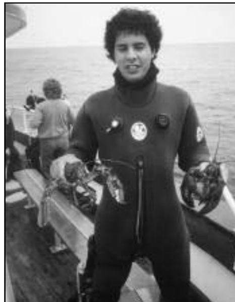
New Jersey divers catch nice lobsters.

D: 609-492-1005 B: 609-709-0226 April - December; Three-quarter Day, Half-Day, Full-Day, Overnight Fluke, Wreck/Reef, Tuna, Billfish (canyon), Shark, Weakfish, Bluefish, Striped Bass Evening Cruise