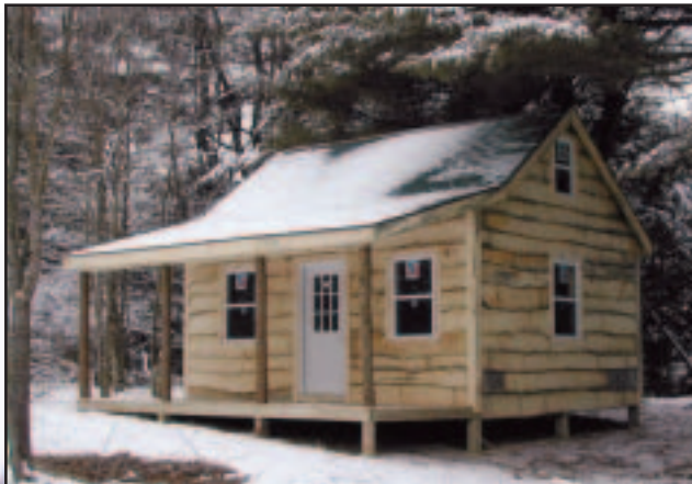
“Classic Adirondacks Camp”