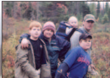
“Great Family Hikes (Scouting)”