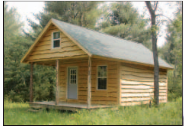
“Poachers Style Cabin”