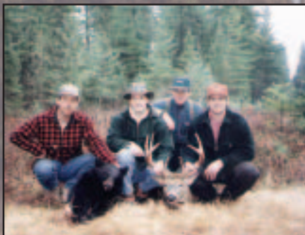
“All Smiles—Successful Adirondack Weekend”