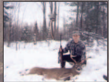
“Build Permanent Tree Stands and Food Plots”