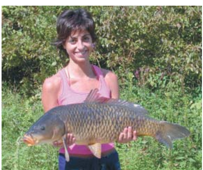
Huge carp await your bait in quiet New Jersey waters.