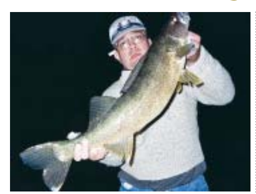
A fabulous New Jersey walleye.

I remember my first encounter with a walleye more than 20 years ago, when I was 16. It was January, and my buddy and I were fishing on six inches of black ice, in three feet of water in a cove on the Delaware River under the Interstate 84 bridge. My fishing buddy brought in a giant fish, 31 inches long and weighing 11 pounds. We had never before seen anything that big in the area except carp. By the process of elimination, we concluded that it must have been a walleye.