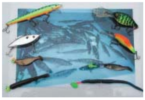
Popular walleye lures

See pages 12 and 13 of this Digest for new season dates, size limits and daily bag limits. The size limit remains at 18 inches, and the bag limit is three fish per day in all New Jersey walleye waters. Boundary waters, such as the Delaware River and Greenwood Lake, have special regulations. The Delaware River has no closed season. Greenwood Lake is closed from March 1 to April 30 to protect walleye during their spawning season.