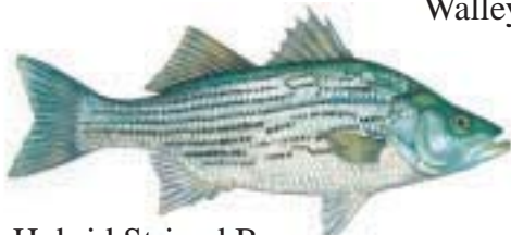
Hybrid Striped Bass