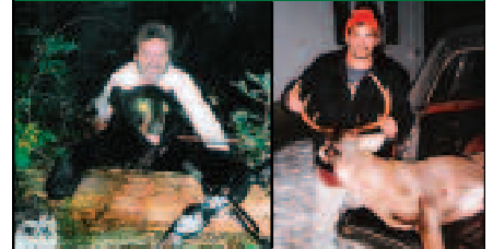
245 lb. buck