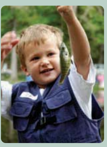
Craig Lemon / NJ Div. Fish and Wild