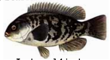
Tautog 14 inches

* Anticipated changes in 2009. Please check the Division of Fish and Wildlife website for the most up to date information.