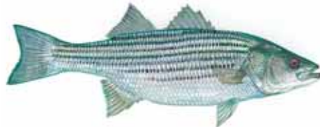
Striped Bass or Hybrid Striped Bass 2 fish at 28" or greater

Open seasons: 4 fish Jan. 1 - Apr. 30 1 fish July 16 - Nov. 15 6 fish Nov. 16 - Dec. 31