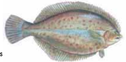
Winter Flounder 10 fish at 12 inches

All other marine waters, open Mar. 1 - Dec. 31