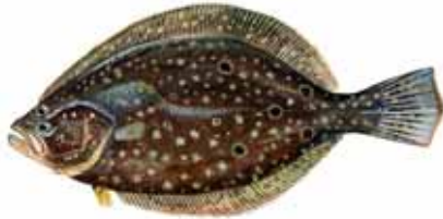
Summer Flounder (Fluke)