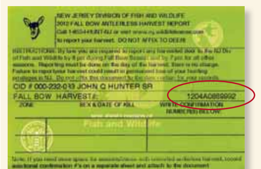
Figure 1: A Harvest Report Number is provided on each license or permit Harvest Report Stub. It is a unique number which identifies both the hunter and the season with which the reported deer is associated.

For more information on the new Automated Harvest Report System, see the list of frequently asked questions (FAQs) at NJFishandWildlife.com/ahrs_faq.htm.