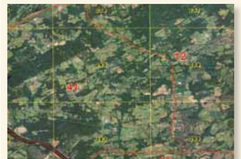
Figure 2: Before going hunting, use the easy, online Deer Hunting Location Viewer to identify your zone, county, township, unit and regulation set.