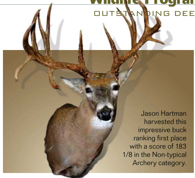
Jason Hartman harvested this impressive buck ranking first place with a score of 183 1/8 in the Non-typical Archery category.

NEW JERSEY'S OUTSTANDING White-tailed Deer Program, initiated in 1964, includes categories for typical and non-typical antlered deer taken with bow, crossbow, shotgun and muzzleloading rifle, in addition to the weight categories listed below. A velvet category is added for early bow season deer.