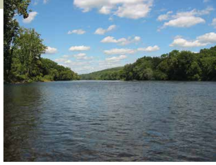
Delaware River near Stockton.

Anglers should also be aware that several procedural changes are now in effect for the Record Fish Program. First, there are different applications for freshwater and saltwater species. Second, for freshwater species, it is now mandatory that a freshwater biologist confirm the identification and weight of any potential record fish within three days of it being caught. Anglers must call Fish and Wildlife's Lebanon Fisheries Office at (908) 236-2118 (Hunterdon County), the Hackettstown Hatchery at (908) 852-4950 (Warren County), or the Southern Region Office at (856) 629-4950 (Camden County) to make arrangements. Hours are Monday-Friday, 8:30 a.m. - 4:30 p.m. These offices have a certified scale on site, so an entry can be weighed and identified. Depending on the time and location of your catch, you may elect to have the fish weighed on a local certified scale, but you must still have a freshwater biologist personally confirm the identification and weight at one of the above offices.