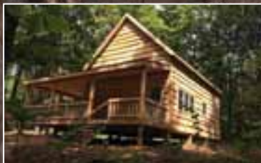
This Cabin on 5 Acres for under $300/month