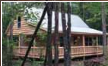
Hunter's Lodge on 5 Acres: $69,995