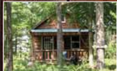
Adirondacks/Cranberry Lake Area: Cabin on 159 Acres with Pond: $179,900