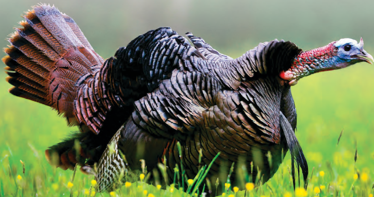
National Wild Turkey Federation

The latest turkey hunting techniques are presented at several turkey hunting seminars sponsored by Fish and Wildlife or wildlife conservation organizations. These seminars focus on how to set up, calling techniques and key safety information for turkey hunters. New turkey hunters are especially encouraged to join us at a seminar. Check our website for seminars scheduled during March or April.