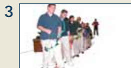
3 One whistle is blown to indicate that shooting can begin in a sequence of steps.