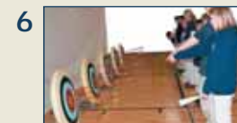
6 After three whistles, the archers proceed to the target line, and score their arrows.

"The archery training our teachers received was so complete and well done that they were confident in their ability to teach it to students. Much of that's because of the emphasis on safety. Each student can be easily monitored to determine their effort, skills, technique and safe conduct. Teachers can address each student and provide individual feedback. The safety whistle codes make sense to students, and the good equipment and standardized training encourage safe participation."