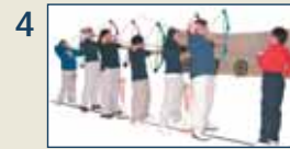
4 Each step of the shooting sequence is triggered by a command from the instructor.