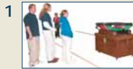
1 Start at the waiting line.