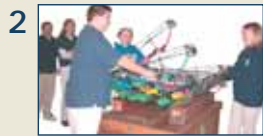
2 Proceed upon hearing two whistles to the shooting line.