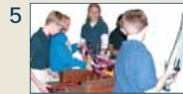
5 When each archer has shot their arrows and the range is clear, three whistles allow the archers to set their equipment aside.