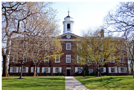
Figure 11. Old Queens, Rutgers University, New Brunswick. (Z. Allen-Lafayette, 2006).

Quarries in the Passaic Formation in Belleville near Newark, however, were the most productive, supplying more material for the fronts of brownstone houses (fig.10) than any other source in the country (Yolton, 1960). A light chocolate-brown sandstone from the area was noted for its quality to rub down to a smooth surface. Old Queens, completed in 1809 at Rutgers University (fig. 11), was built of Belleville brownstone from the Passaic Formation.