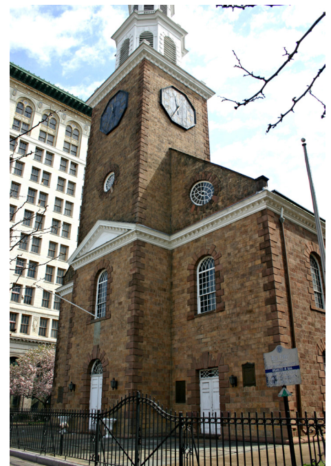
Figure 8. Old First Presbyterian Church, Newark. (Z. Allen-Lafayette, 2006).

Brownstone quarried from the Passaic Formation near Newark provided the building stone for the Old First Presbyterian Church in