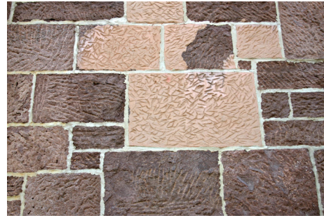
Figure 16. Repaired brownstone. (Z. Allen-Lafayette, 2006).

Proper façade maintenance specific to sandstone is critical to prevention of deterioration. Repairs may be complex and are best performed by a professional restorer (fig. 16).