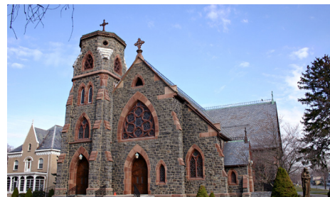
Figure 13. St. Mary’s Church in Wharton Boro, Morris County, was designed by Jeremiah O’Rourke, and erected in 1872. The church is unusual for the use of local mined stone, Little Falls brownstone trimmings, open truss roof, and pre-opalescent glass (N.J. Historic Trust). (Z. Allen-Lafayette, 2006).

By the turn of the twentieth century, quarrying was on a much