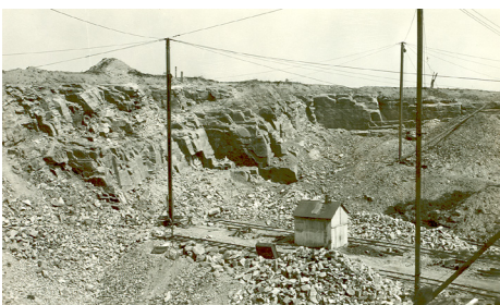
Figure 5. Raven Rock Brownstone Quarry with narrow gauge railroad and derricks, Delaware Township, Hunterdon County. May 19, 1932. (NJGWS Archives).

When it became available, steam power was used in the excavation and removal of stone from the quarry floor. Huge derricks were set up on promontories jutting into the quarries at right angles to the quarry face to remove the stone (fig. 5). The derricks would pivot around a base so that nearly every