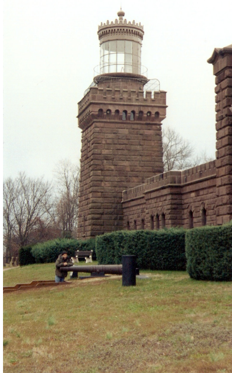
Figure 12. The Navesink Twin Lights lighthouse south tower in Highlands Boro. The lighthouse sits 200 feet above the Atlantic Ocean. (L. Pallis, 2006).

By the mid nineteenth-century, many of the quarries, especially in