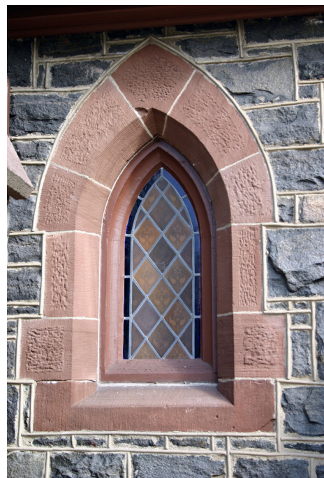
Figure 14. St. Mary’s Church brownstone trimmed window. (Z. Allen-Lafayette, 2006).