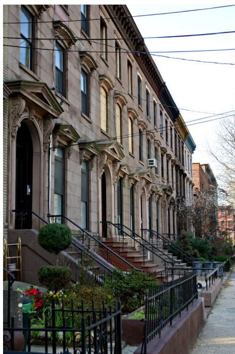
Figure 10. Brownstone fronted row houses, Van Vorst Park, Jersey City. (Z. Allen-Lafayette, 2006).

local workmen, due to its deep, rich color (Yolton, 1960). Shipped via the Morris Canal, this stone was used in the construction of mansions and churches in Paterson, Newark and New York City (fig. 9).