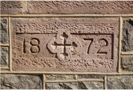
Figure 15. St. Mary's Church brownstone cornerstone with date. (Z. Allen-Lafayette, 2006).

smaller scale (Yolton, 1960) with most brownstone now going into foundation work and windowsills of buildings (figs. 13, 14, 15).