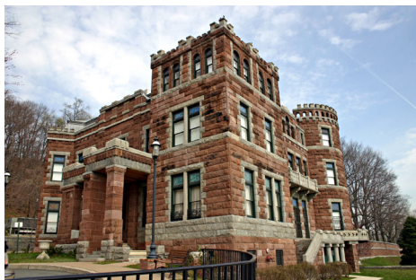
Figure 9. Lambert Castle, located in Paterson, was built with a brownstone exterior in 1893 by wealthy silk manufacturer, art collector, and amateur architect Catholina Lambert. (Z. Allen-Lafayette, 2006).

Brownstone quarries in thick beds at Little Falls in Passaic County produced a superior, fine-grained red building stone from the Passaic Formation. The sandstone was dubbed “liver rock” by