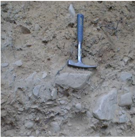
Figure 3. Basal till. This unsorted and unlayered mixture of clay- to cobble-sized material was laid down at the glacier's base.

from nearby bedrock may make up as much as 20 percent of the deposit by volume. They typically have a subangular to subrounded shape, and many are striated and polished. These features were formed during glacial transport. Overlying this lower compact till is a thin, discontinuous, noncompact, poorly sorted silty sand or sand containing as much as 35 percent pebbles, cobbles, and boulders, and interlayered with thin beds of sorted sand, gravel, and silt. Typically these stones are more angular than those in the underlying till. This material melted out of the glacier, and was gradually let down on the land surface as the glacier ice melted. It is called ablation till . If the material has flowed onto adjacent glacier ice or land (fig. 2), then it is called flowtill .