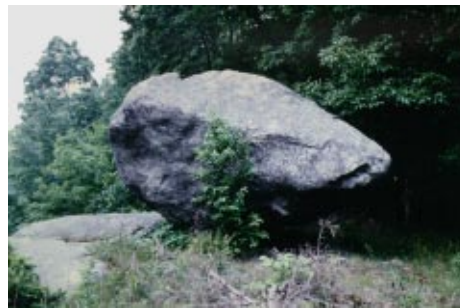
Figure 4. Large erratic lying on bedrock. The boulder is about 10 feet in length.

G lacial erratics (fig. 4) are rocks transported by glaciers and laid down a distance, often many miles, from their original location. Many are unlike the bedrock on which they rest because glacial ice in many places flowed across different types of bedrock. Most show evidence of glacial erosion by their subrounded to rounded shape, faceted sides, and striated and polished surface. They are found throughout northern New Jersey and they record the direction the glacier flowed.