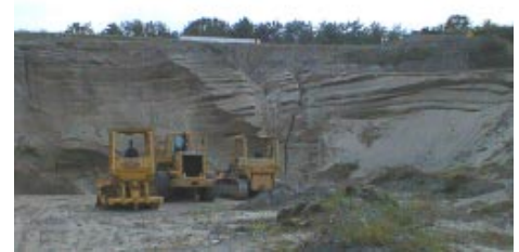
Figure 6. Inclined layers of sand; also called foreset beds. These well sorted and layered sediments were laid down in a glacial lake.

T he economic value of glacial sediment in New Jersey has enormous potential. Some of the state's most prolific sources of drinking water are the many coarse-textured stratified glacial deposits laid down during the last ice age. This material has also been mined for use as aggregate, select fill, surface coverings, decorative stone, and building stone. Deposits of clay and silt are used as liner and cap material for landfills, and till is locally used as fill.