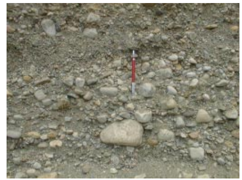
Figure 5. Horizontally-layered gravel and sand. These coarse-grained sediments were laid down by a glacial meltwater stream.

M eltwater deposits consist of layered gravel, sand, and silt laid down by meltwater streams at and beyond the glacier margin (fig. 2). Based on their texture, nature of layering, and their depositional environment, they are placed into three groups. The first consists of stream deposits (fig. 2). These are largely made up of horizontal to gently dipping layers of coarse to fine gravel and sand (fig. 5) laid down in valleys that drained away from the glacier. The second group is made of deltas and lacustrine-fan deposits. These chiefly consist of steeply to gently dipping layers of fine gravel, sand, and silt (fig. 6) called foreset beds that were laid down in glacial lakes. The third group consists of lake-bottom deposits. These are largely made up of horizontal, very thin layers of silt, clay, and very fine sand that were laid down on the floor of glacial lakes either by the settling out of suspended sediment from the murky lake water, or by deep-water currents.