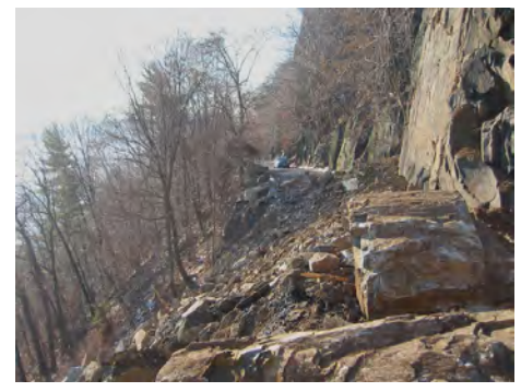
Figure 10 . Photograph of the December 17, 2005, rockslide damage on the Alpine Approach Road in Alpine.

during August of 1961. Nearly 2,000 tons of rock slid off the Palisades, tearing up 100 feet of the Alpine