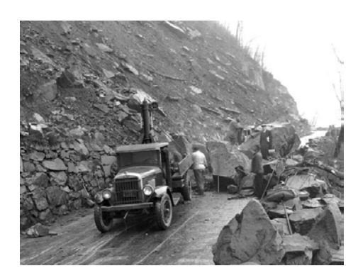
Figure 7 . Photograph of a rockfall on Henry Hudson Drive March 8, 1933, in Bergen County.

One the most active landslide areas is the Palisades located in northeastern New Jersey along the Hudson River. Here, large rockfalls and rockslides occur along high cliffs formed of Triassic diabase (figs. 7 and 8). They are most common in the winter and spring after freeze-thaw cycles have loosened pieces of rock along joints and fractures. Surface water also seeps into joints or cracks in the rock, increasing the weight of the rock and causing expansion of joints when it freezes, thus prying blocks of rock away from the main cliff (Hansen, 1995).