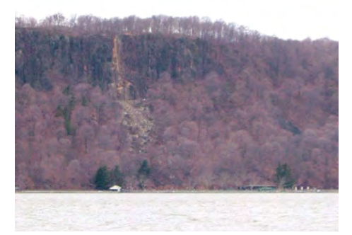
Figure 9 . Photograph of the December 17, 2005, rockslide on the Alpine Approach Road in Alpine.

There were witnesses to a rockslide in the same area one summer morning