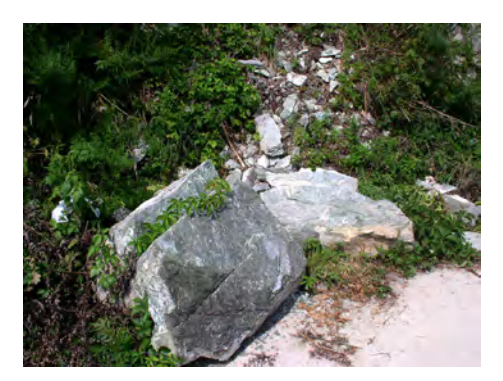
Figure 3 . Small rockfall along Sinatra Drive, Hoboken, Hudson County.

Landslides are categorized by the different materials they contain and the mode of movement of the slide (Varnes, 1978). Landslides mapped by NJGS were slumps, debris flows, rockfalls and rockslides. Slumps are coherent masses that move downslope by rotational slip on surfaces that underlie and penetrate the landslide deposit