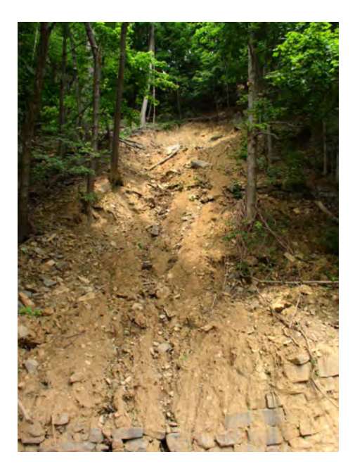
Figure 2 . Scar of debris flow above Henry Hudson Drive, Alpine, Bergen County.

April 15-16, 2007 - Several damaging landslides occurred during a northeaster. The most destructive one occurred in Lodi, Bergen County, along Farnham Avenue and was triggered by as much as eight inches of rain. Fifty families were displaced from six homes and an apartment building after they were deemed too dangerous to inhabit. A landslide also caused a highway accident on Route 208 southbound near Lincoln Avenue in Glen Rock, Bergen County. There were no injuries but the highway was closed until the vehicles and mud could be cleared. At least six landslides occurred along the Palisades in Bergen County from Fort Lee to Alpine, closing Henry Hudson Drive for over a month (fig. 2). Also, a small rockfall blocked traffic for a time along Sinatra Drive in Hoboken (fig. 3) and a small debris flow occurred in a residential area in Highlands Borough, Monmouth County (fig. 4).