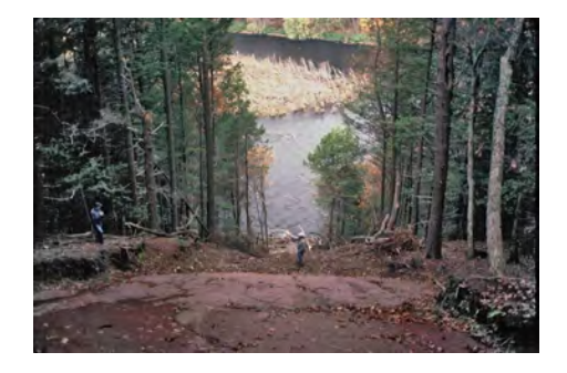
Figure 12. Photograph of a massive landslide in the Delaware Water Gap National Recreation Area, Hardwick Township, Warren County, New Jersey.

Heavy rain and excessive saturation of unconsolidated slope material triggers many landslides in New Jersey. During October 1995, a massive debris flow occurred just downstream from Wallpack Bend in Hardwick Township, Warren County (fig. 12). It was sited along the steep undercut northwest slope of Kittatinny Mountain at the outer bend of a meander of the Delaware River. Heavy rain (3.3 inches) fell near the site of the