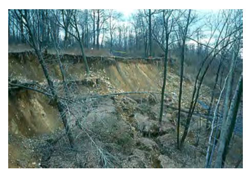
Figure 14 . Landslide which destroyed Bellwood Farm Road, Bethlehem Township, Hunterdon County in 1989.

Over steepening of slopes by human activity causes many landslides in New Jersey. Road construction, cutting of trees and other vegetation on landslide-prone slopes, land development, mining and quarrying have made steep slopes susceptible to landslides.