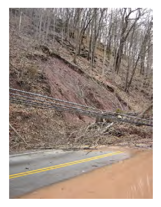
Figure 13 . April 2005 landslide one mile south of Milford in Holland Township, Hunterdon County.

feet in width and 600 feet downslope, extending into the Delaware River an additional 60 feet. The total volume of soil displaced was calculated to be about 48,000 cubic feet (Epstein 2001). Figure 13 shows a smaller, but similar landslide in Hunterdon County. Here, thin soil and loose rock, slid off a steep slope of Triassic shale during a period of heavy rain, blocking Milford-Frenchtown Road.