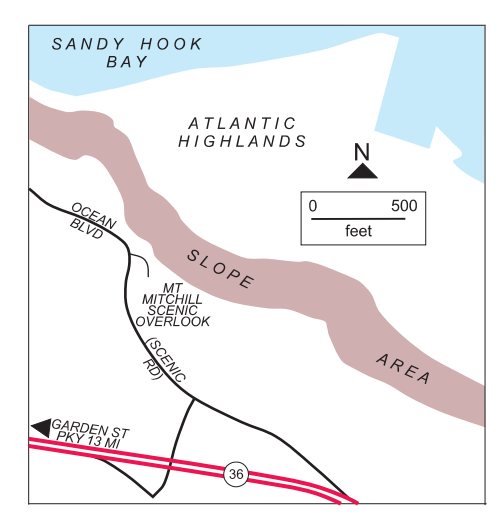
Figure 6 . Map showing location of Mt. Mitchill Overlook, cartography by B. Graff.

a Monmouth County Park where there is also an interpretive plaque that explains the history of slumping in the Atlantic Highlands (fig. 6).