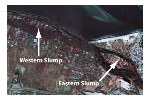
Figure 5 . Aerial photograph with arrows showing the old slump blocks in the Atlantic Highlands area.

Today the western slump block (fig. 5) is 400 feet wide and 2,500 feet