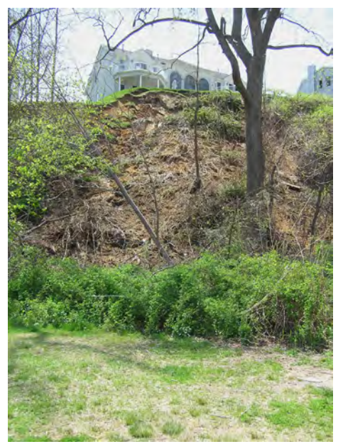
Figure 4 . Landslide in Highlands Borough, Monmouth County, triggered by heavy rains from the April 15-16, 2007, northeaster.

(Briggs et al, 1975). A debris flow, sometimes referred to as a mudslide. is a form of rapid mass movement in which a combination of loose soil, rock, organic matter, air, and water mobilize as a slurry that flows down slope. Debris flows are commonly caused by intense surface water flow from heavy precipitation or rapid snowmelt that erodes and mobilizes loose soil or rock on steep slopes. Rock falls are common in roadway cuts and steep cliffs and are abrupt movements of masses of geologic materials, such as rock and boulders that become detached from steep slopes or cliffs. Rockslides are the movement of newly detached segments of bedrock sliding on bedding, joint, or fault surfaces or any other surface as a relatively cohesive unit (Delano and Some landslides Wilshusen, 2001). are composites of two or more of these