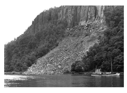
Figure 8 . Rockslide north of Twombly's Landing, Alpine, 1938.

A rockslide on December 17, 2005 occurred above the Alpine Boat Basin destroying approximately eighty feet of the Alpine Approach Road. The majority of the rockslide stopped at the boat basin parking area where it