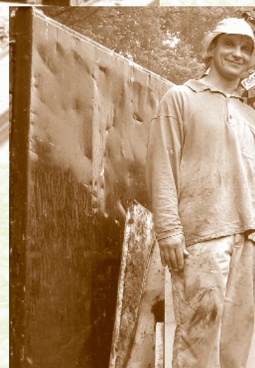
Merrill Lynch employees and their up the Flemer Preserve.