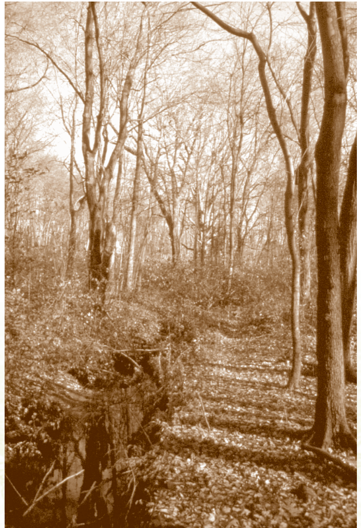
Winter view of forest and stream at the Moorestown Preserve.