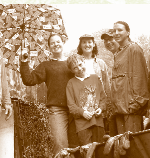
families donate their time on a rainy day to clean