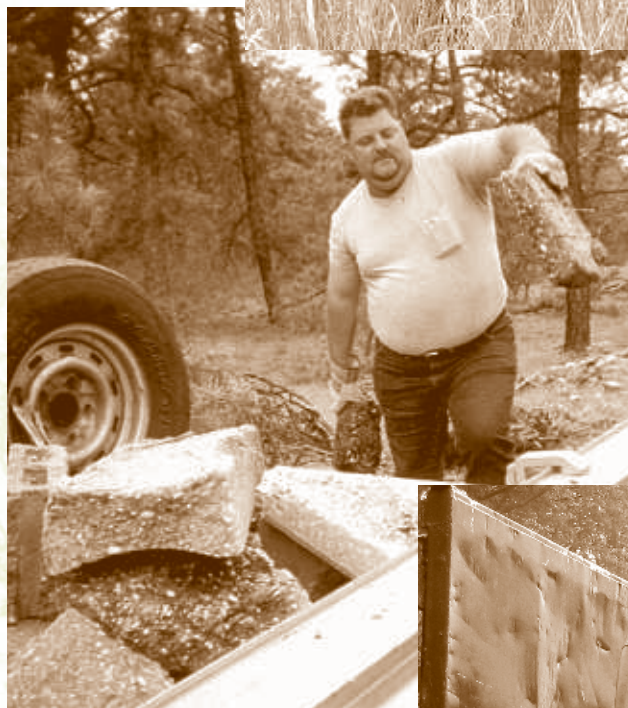
A volunteer removes concrete rubble at the Crossley Preserve.