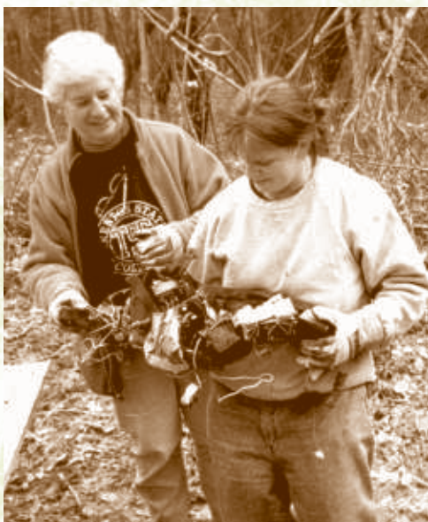
Volunteers from Ocean County Community Options, Inc. clean up trash at the Tilton's Creek Preserve.

Office volunteers were involved in Trust Web site design, data entry, contributing to the volunteer renewal mailing, and making volunteer appreciation gifts. Groups that participated in office projects included Mercer County Community Options, Inc. ,