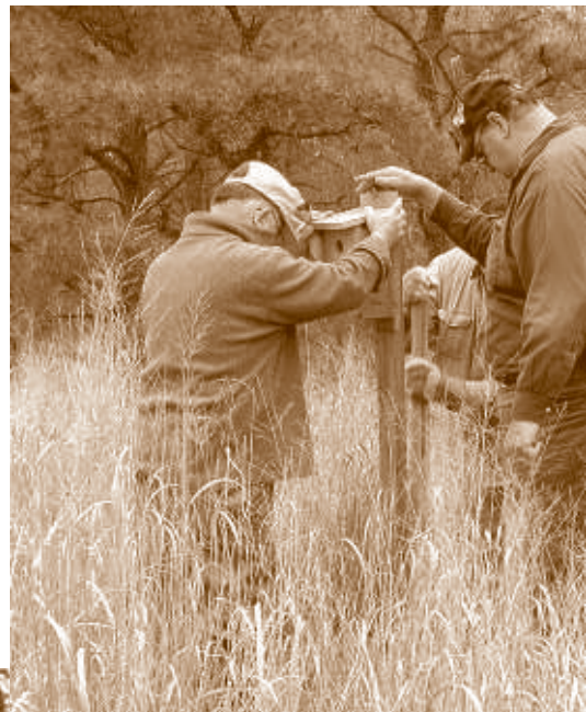
Volunteers install a new bluebird house at the Crossley Preserve.

The Trust currently has nearly 400 volunteers registered to be notified when management projects become available. These volunteers have indicated which areas of the State they are available to contribute their volunteer effort. Management projects in 2003 included trail maintenance and removal of rubble, consisting of tons of dumped concrete, at the Crossley Preserve; gathering and disposing over 1,000