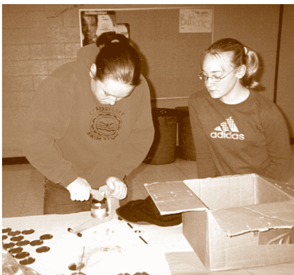
The Byram Township Intermediate School Environmental Club makes volunteer gifts.

In 2003, volunteers continued to assist the Trust in numerous ways. Overall, volunteers contributed 1,278 hours. Volunteers spent 280 hours on management projects such as major preserve cleanups, 32 hours volunteering in the Trust's office, and 94 volunteer preserve monitors spent 966 hours keeping an eye on 52 Trust preserves and also picking up light trash.