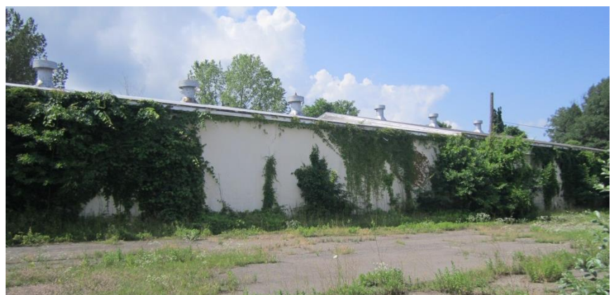
SMALL WAREHOUSE COMPLEX (middle) Bldgs 7 + 8