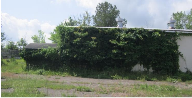
SMALL WAREHOUSE COMPLEX (East end) Bldg 7