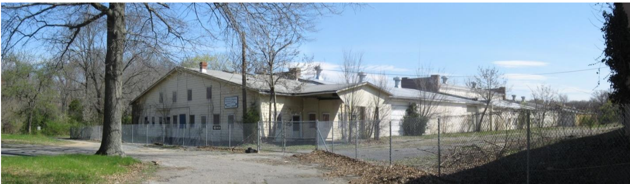
LARGE WAREHOUSE COMPLEX from west