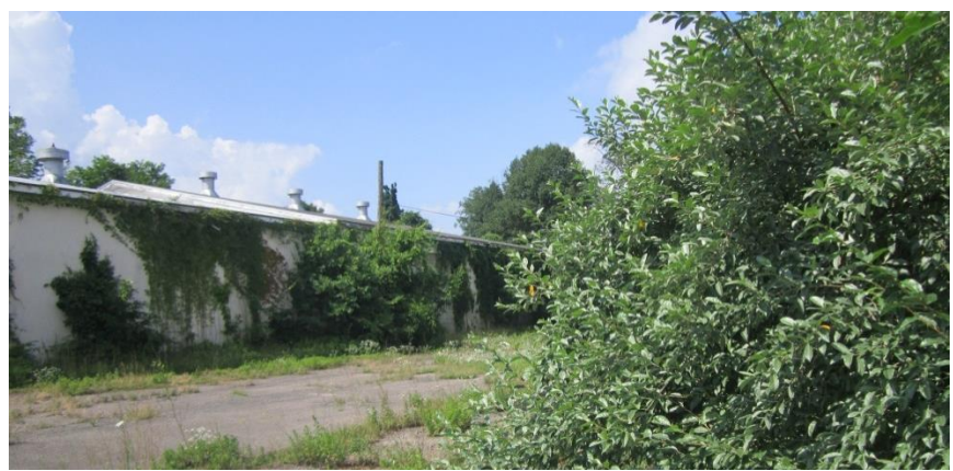
SMALL WAREHOUSE COMPLEX (west end) Bldgs 7 + 8