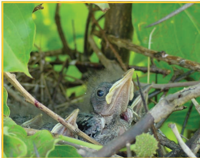
Baby mocking birds are common to urban areas

While supplies last, every family that pre-registers will receive an official "Celebrate Urban Birds!" Celebration Kit. Each kit comes in both English and Spanish and contains a colorful urban birds poster, educational materials about birds and