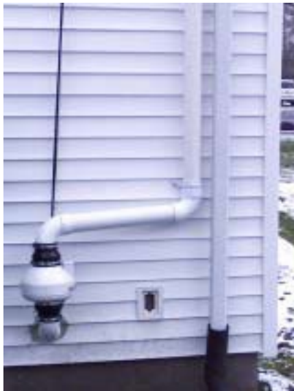
A subsurface depressurization system fan on the exterior of a building.

An effective method to prevent vapor intrusion during the cleanup process is to install subsurface depressurization systems at the affected buildings. The two most common types are the sub-slab depressurization system and the sub-membrane depressurization system .