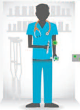
HEALTHCARE PROVIDER with Hepatitis C or other bloodborne infection tamper with injectable drug