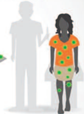
EXPOSURE OF PATIENT results from use of contaminated drug or equipment for patient injection or infusion

*Drug diversion occurs when prescription medicines are obtained or used illegally by healthcare providers.