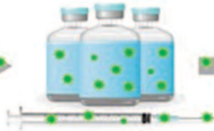
CONTAMINATED INJECTION EQUIPMENT AND SUPPLIES present in the patient care environment