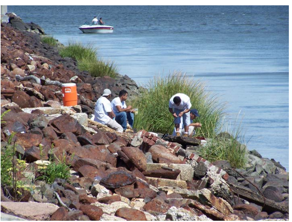
7) and 8) Examples of individuals walking and sitting on slag