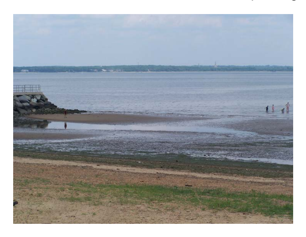
2) Area 2 – Beach area in Area 2