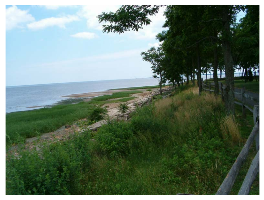
11) and 12) Area 1 – Paved walkway viewing Area 1