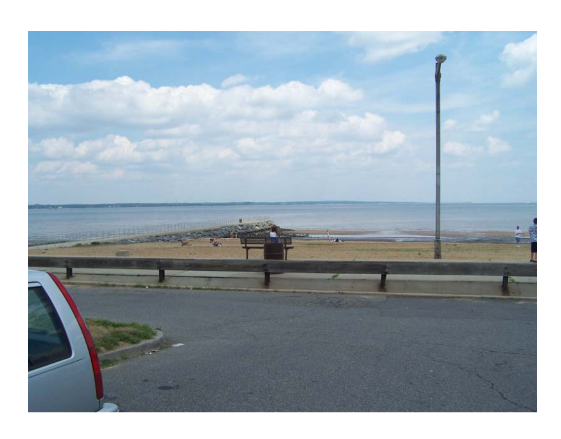
1) Area 2 – Area 2 as viewed from main parking lot