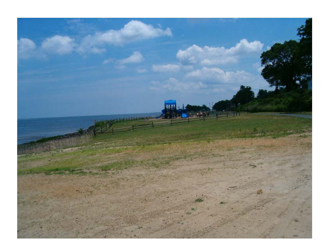
4) Area 2 – The playground (Area 6) as viewed from Area 2