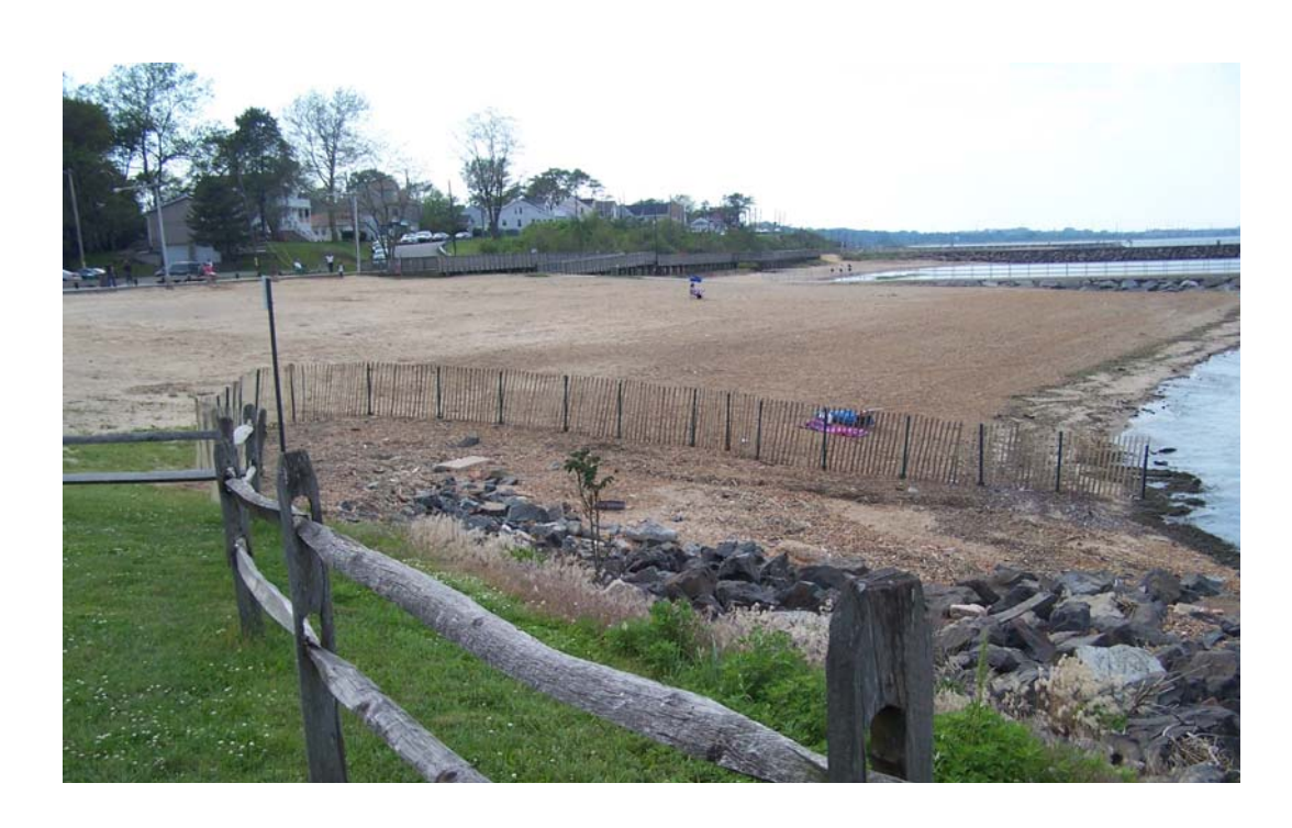
6) Area 2 – The fenced in hotspot area in summer 2008