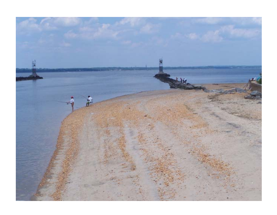
13) Area 4 – Beach area at the Cheesequake Creek Inlet