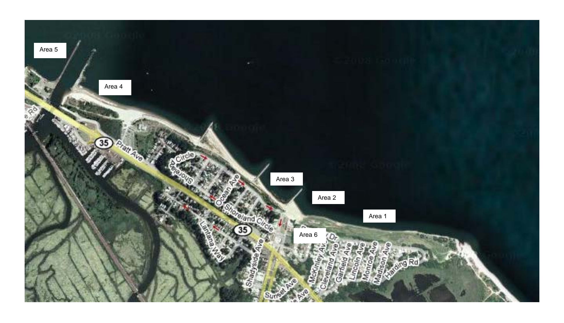
Figure 1: Location of the Raritan Bay Slag Site