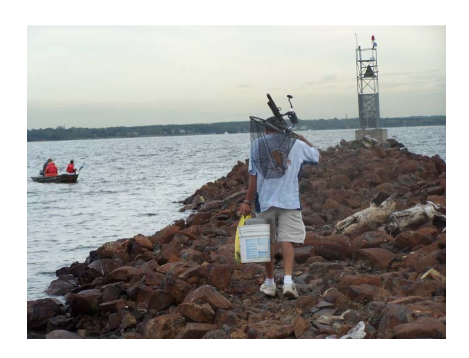
14) Area 5 – Cheesequake Creek InletWestern Slag Jetty