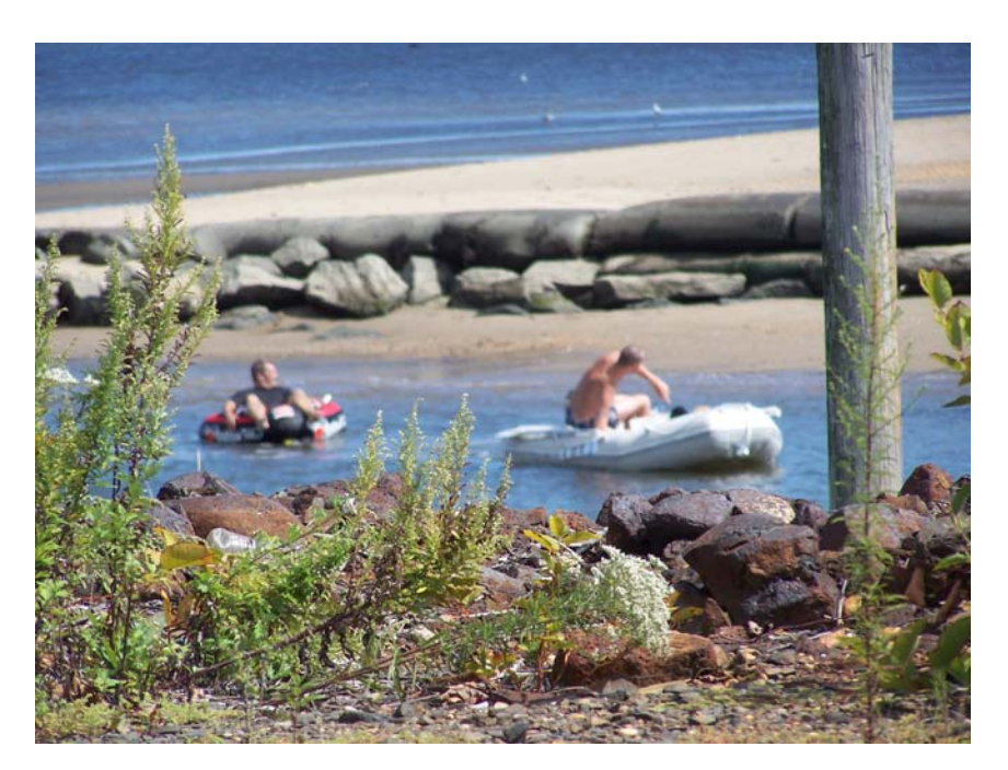
9) and 10) Examples of recreational activities