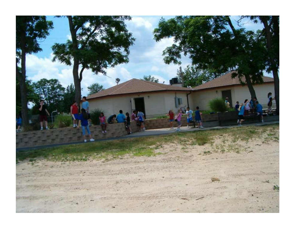
3) Area 2 – Day camp as viewed from Area 2