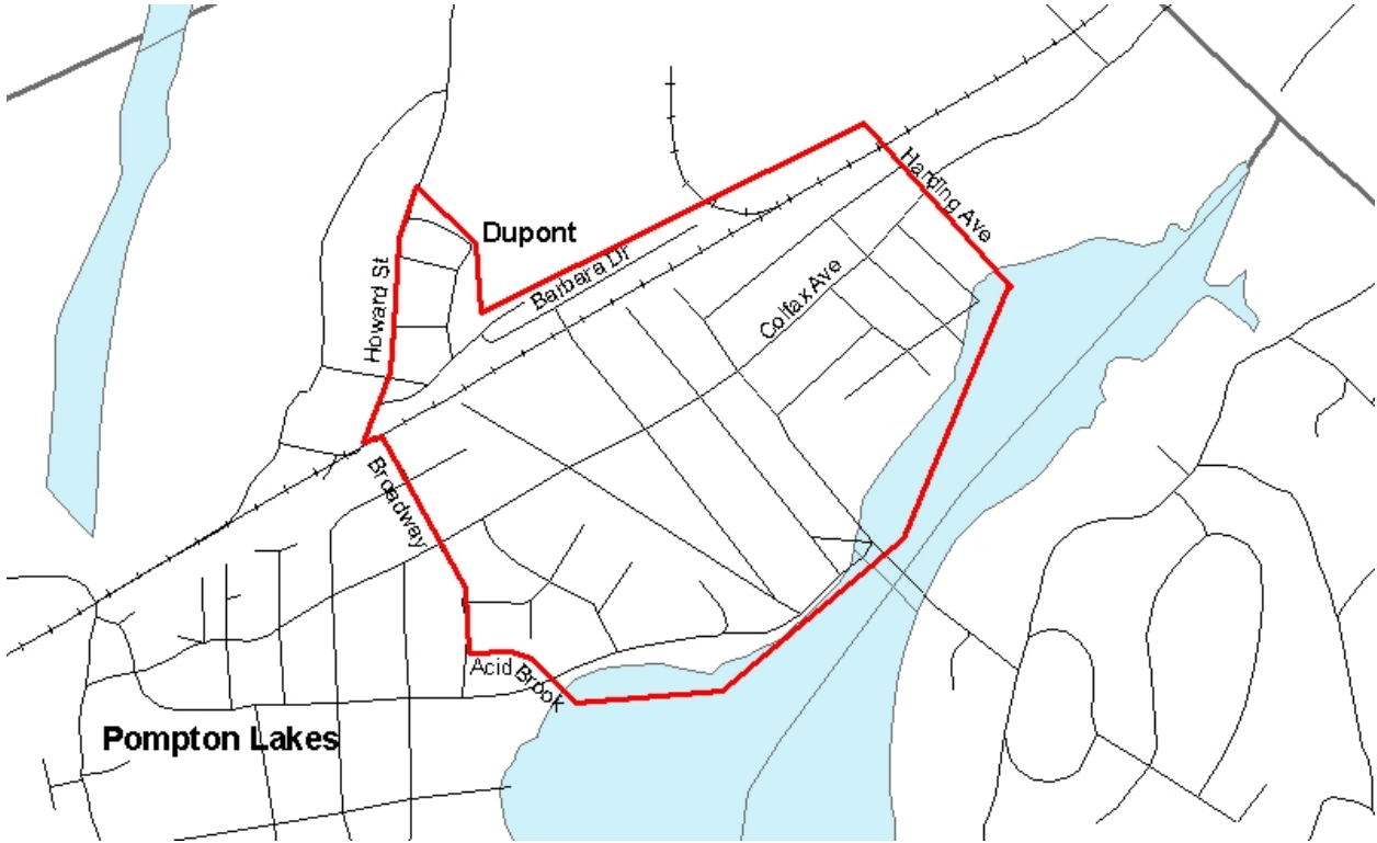
Figure 1. Pompton Lakes Survey Area.