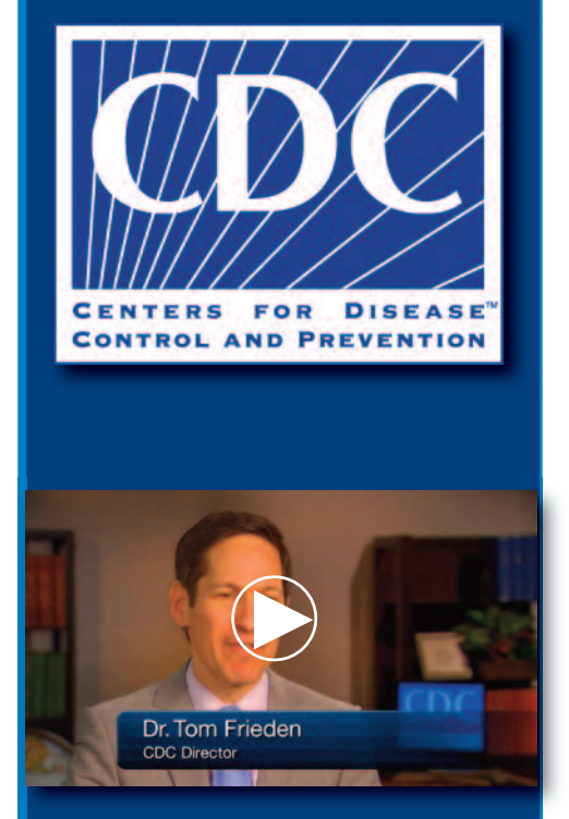
CDC Video: Opioid Painkiller Prescribing: Where You Live Makes a Difference.

New Jersey's drugrelated death toll has risen steadily from 843 deaths in 2010, to 1,026 deaths in 2011, and to 1,294 deaths in 2012.